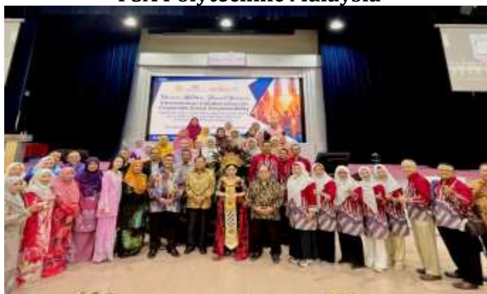
Figure 3. PKM-I Participants from UNPAM and PSA Polytechnic Malaysia