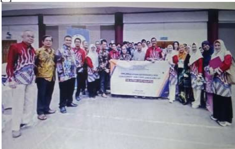
Figure 2. Group Photo of PKM-I Participants from UNPAM, PCA and PSA Polytechnic Malaysia

In line with the signing of the work of the three participants, PCA, PSA Polytechnic Malaysia and UNPAM, PCA also carried out a cooking demonstration which was entirely carried out by autistic sufferers who are members of PCA Malaysia. This activity certainly needs to be appreciated considering that PCA Malaysia has succeeded in enabling autistic sufferers to rediscover their identity as people who can benefit society and their environment. Apart from this, the participants and autistic sufferers from PCA also held a unique exhibition, where on this occasion they displayed their work in the form of various handicrafts, knitting products and various cakes, all of which were purely produced by them. On this occasion, in accordance with the PKM-I theme, the Rector of UNPAM emphasized the importance of the QRIS payment application in Malaysia, considering that Indonesia has proven it for almost 4 years since August 2019 and in 2023, QRIS users in Indonesia are almost 46 million [9].