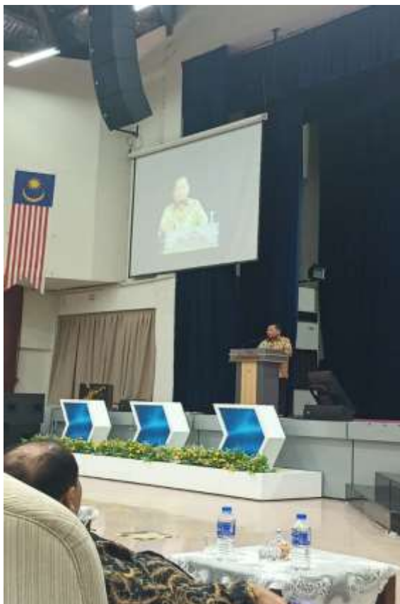
Figure 4. Rector UNPAM Delivered Keynote Speech