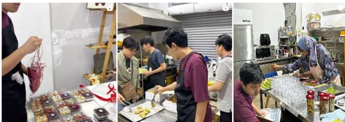
Figure 5. Activities of Autism Café Project (PCA) Malaysia