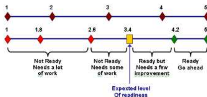
Figure 3 <Measurement Scale of Model ELR>