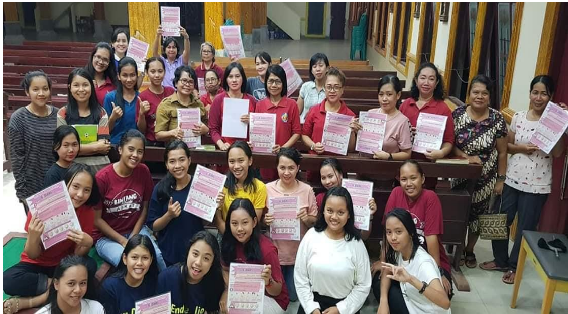
Figure 2 Breast Self-Examination Education with Leaflet In East Central Kalimantan

women are aware of breast cancer as a disease, but their in-depth knowledge of the cancer is lacking. Therefore, providing more information and health education is important to increase awareness of breast cancer detection (Liu et al., 2018) Efforts to empower women through disseminating information and understanding the need for early detection of breast cancer (Figures 2,3,4, and 5 ) need to be carried out continuously from various parties to encourage women to turn fear into awareness and care by detecting them. early cancer which is the best step so that the incidence of breast cancer can be detected at an earlier stage so that the morbidity and mortality due to breast cancer are reduced (Ayue, n.d.)