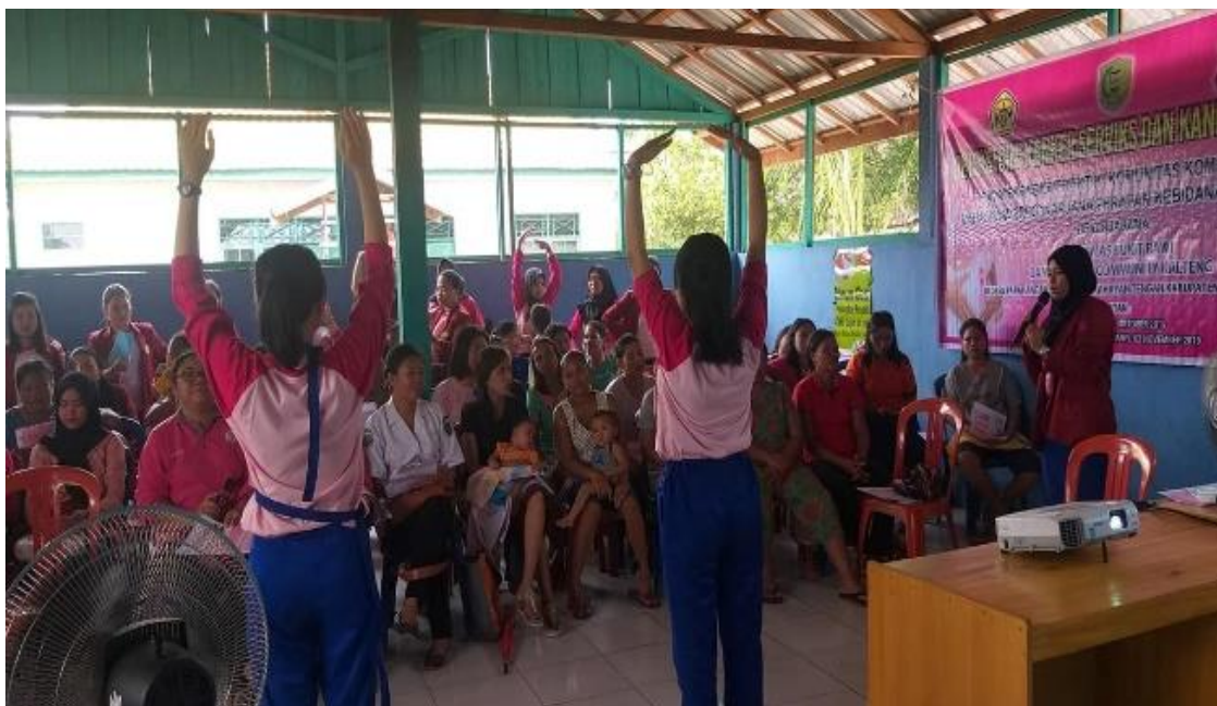
Figure 3 Breast Self-Examination Demonstration in Parahangan Village, Kahayan Tengah District, Pulang Pisau Regency, Central Kalimantan