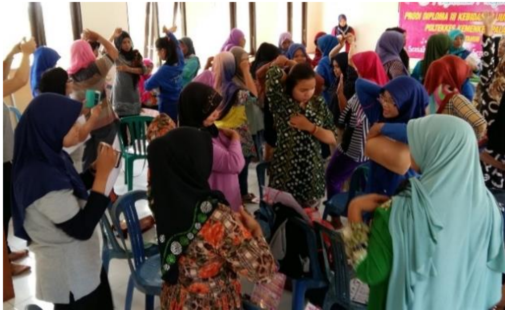
Figure 4 Simulated Breast Self-Examination for A Women Group In Kereng Bangkirai Palangka Raya City