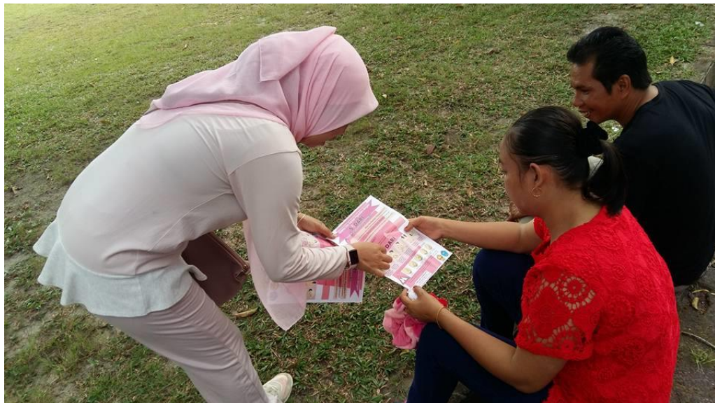
Figure 5 Pink Care Community Volunteers Explained Breast Self-Examination To Couples at Car Free Day Location Palangka Raya City

The use of intervention tools such as leaflets containing clear, precise information about breast cancer, signs, symptoms, risk factors, screening, and steps to carry out SaDaRi is important in efforts to reduce mortality from breast cancer (Ali AN, Foong JY, Ying CH, 2019; Rahman et al., 2019).