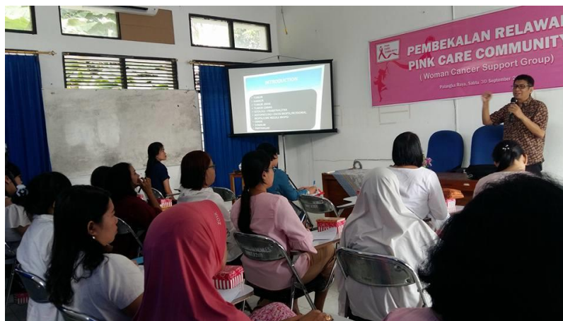
Figure 7 Pink Care Community Volunteer Training