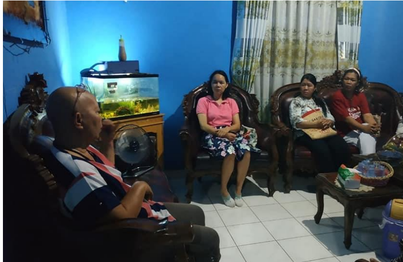
Figure 9 Visitation to Breast Cancer Warrior by Pink Care Community Volunteers

Anxiety and depression are the most common conditions experienced by women with breast cancer. Low emotional support and social networks are risk factors for more symptoms than some other psychological disorders (Puigpinós-Riera et al., 2018). Support groups are effective at reducing psychological stress and supporting the quality of life for women with breast cancer (Cipolletta et al., 2019).