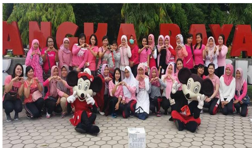
Figure 8 Pink Care Community Volunteers Have Distributed 1000 Leaflets Breast Self-Examination at The Car Free Day Bundaran Besar of Palangka Raya City