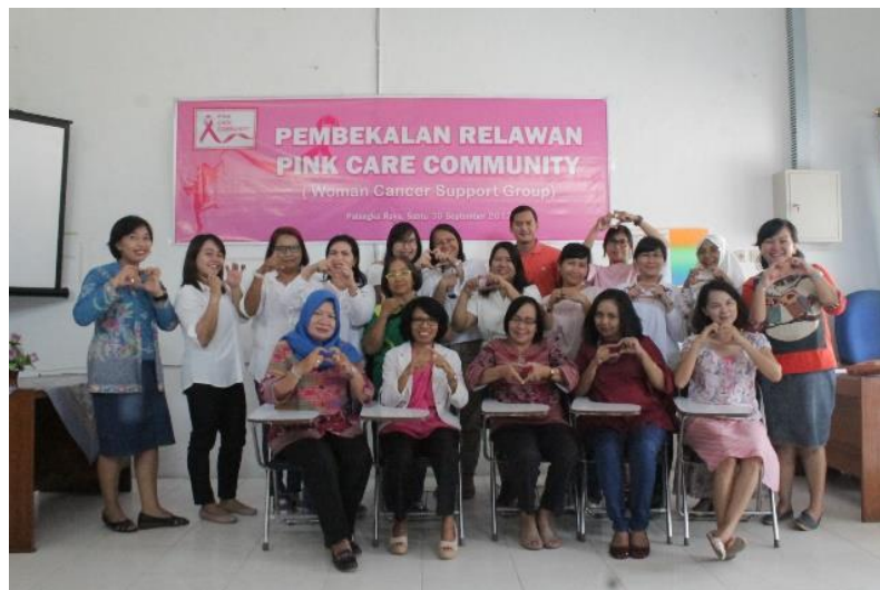
Figure 6 Breast Cancer Support Group “Pink Care Community”