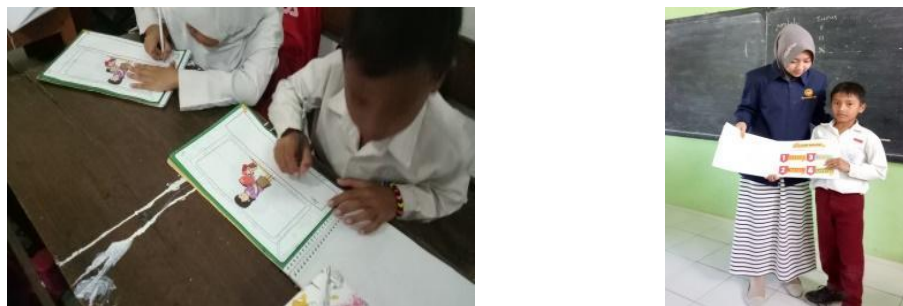
Figure 3. Learning activities with scrapbook of child stories

The data obtained in this study were the results of the storytelling skills test aimed at grade II students. The test is carried out in two stages, namely pretest and posttest. Pretest is given to students before students get treatment, while posttest is given after students carry out the learning using scrapbooks of child stories media. The research data was taken to determine the differences in the control class and the experimental class. The control class is a class that follows learning without using scrapbook of child stories media, while the experimental class is a class that takes part in learning activities using scrapbook of child stories media. Table 1 displays the descriptive statistics of the control class and experimental class at the pretest stage.