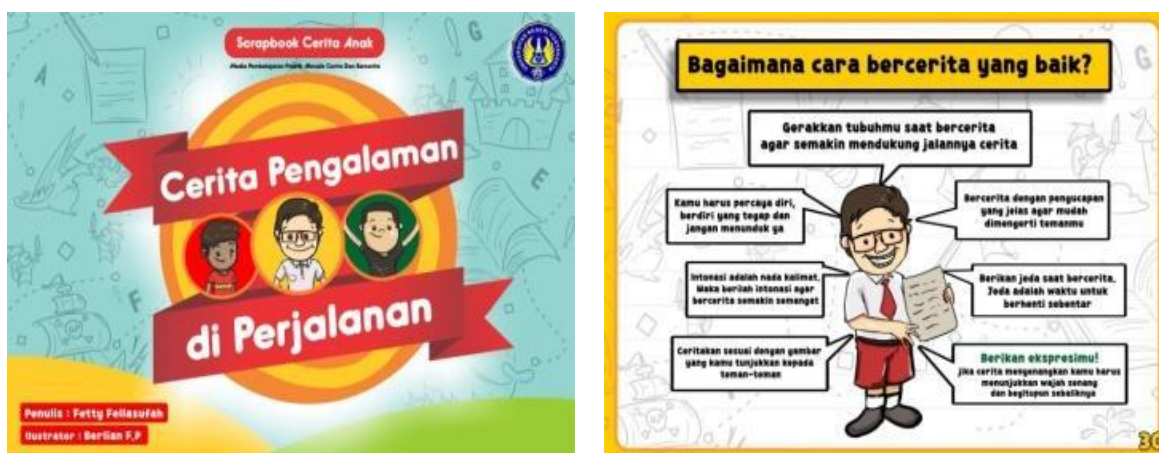
Figure 2. Design scrapbook of child stories

The scrapbook of child stories contains Indonesian language teaching materials especially story writing and storytelling materials for grade II students of elementary school. The scrapbook of child stories referred to the teaching objectives, Curriculum 2013, standard of competence, core competence, basic competence, indicators of learning, and teaching materials. The innovation developed by adjusting the components and learning objectives. Arranging the content according with the objectives will have a good effect [22]. The scrapbook of child stories consists of several parts, including the introductory part, content part, final part, and closing part. Consist of the scrapbook based on the literature study conducted. Scrapbook child stories a media for learning storytelling referring to concept of innovation, functioning of the innovation, its benefits, and its meaning [23]. The learning materials are presented with illustration and pictures interesting to creating learning activity enthusiastic for students. The Figure 2 are the cover design and material contained on scrapbook of child stories. The title used is an adjustment to the learning theme and goal as well as the material presented. In the Figure 3, there are some pictures of learning activities carried out using scrapbook of child stories.