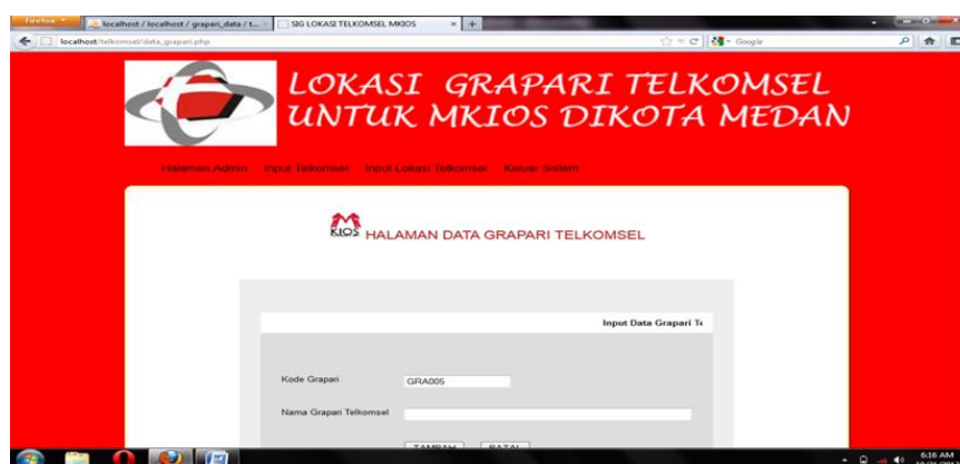
Figure 6. Branch Office Data Page

The results of the display of the Telkomsel Grapari page that the author made can be seen in Figure 6. Following: