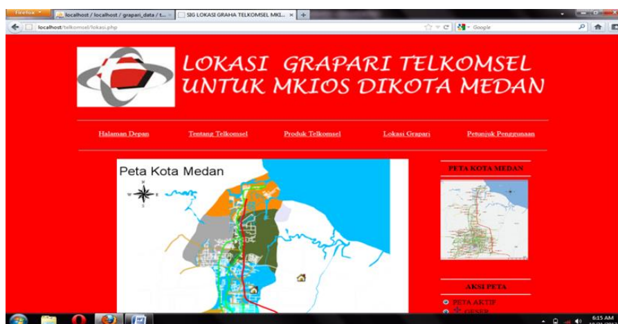
Figure 4. Grapari Location Page

The results of the display of the grapari location page that the author made can be seen in Figure 4 below