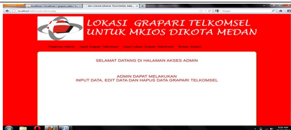
Figure 5. Admin page

The results of the display of the Telkomsel Grapari page that the author made can be seen in Figure 6. Following: