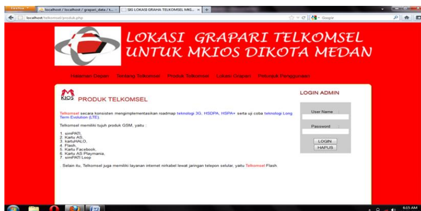
Figure 3. Telkomset Product Pages

The results of the display of the grapari location page that the author made can be seen in Figure 4 below