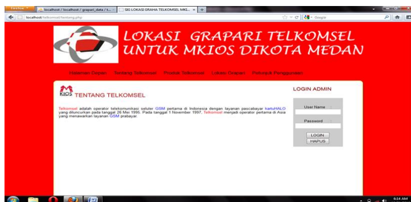
Figure 2. Page About Telkomsel

The results of the page display about Telkomsel that the author made can be seen in Figure 2. following;