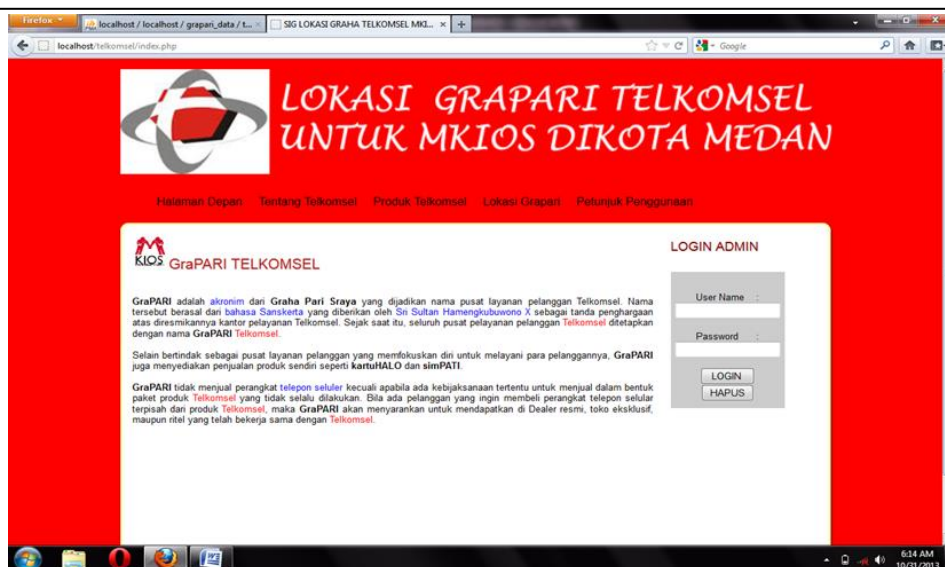
Figure 2. Front Page

The results of the page display about Telkomsel that the author made can be seen in Figure 2. following;