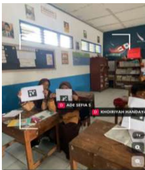
Figure 1 <Student Barcode Paper Scanning>

The implementation of Quizizz certainly has obstacles that may occur during its application. The obstacle in implementing Quizizz paper mode during learning evaluation is the obstacle experienced by students when the teacher scans the barcode owned by the student. The obstacle here is caused by the scanning system which is so fast that when the student has not prepared the answer, the scanner will automatically scan the barcode owned by the student if the barcode is captured by the scanner camera. However, students do not need to worry about this obstacle because even though the initial answer has been scanned, it can still be re-scanned so that the answer can be replaced.