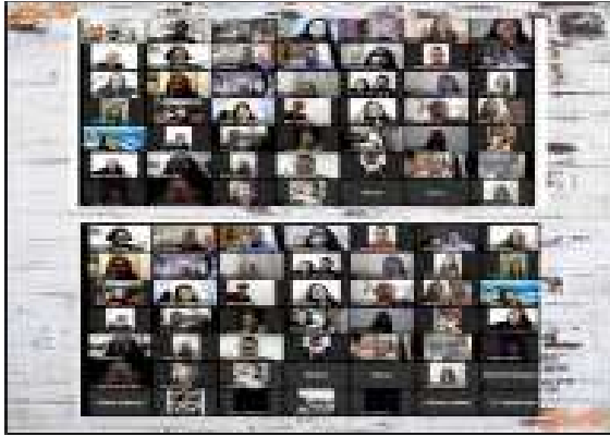
Figure 8. Glorify the Lord Ensemble choir rehearsing during the pandemic via the Zoom application.