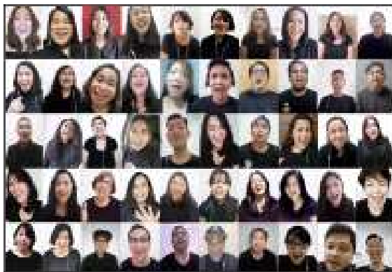
Figure 3. Glorify the Lord Ensemble Choir Contents During the Pandemic entitled Lean On Me Glee Version.

Overall, the journey and existence of Glorify the Lord Ensemble in the music industry is an inspiring example of how a music group can survive and develop through effective strategy, dedication and continuous innovation. By constantly adapting to changes in time and technology, as well as maintaining quality and closeness among its members, Glorify has been able to maintain its existence and contribution to the world of Indonesian music.