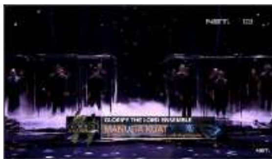
Figure 1. Glorify the Lord Ensemble Choir Sings With Tulus At NET TV’s Birthday Event.

To this day, Glorify the Lord Ensemble is still active, including performing at events, rehearsing weekly, and continuing to create original works with its members. This is one of the reasons why Glorify remains attractive to musicians and music lovers. According to (Pangaribuan, & Manalu, 2017, p. 4) vocal groups and church choirs are growing and able to perform at various events outside the church, thanks to regular training for service activities. In line with Zanki’s opinion through symbolic interaction theory, the adaptation process of a group reflects the principles of symbolic interaction, where the group adapts to the expectations and needs of the audience and the wider social context (Zanki, 2020, p. 116). Church choirs also continue to innovate and develop, as demonstrated by Glorify the Lord Ensemble.