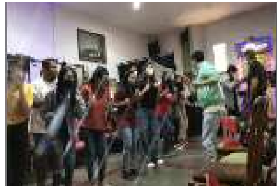
Figure 6. Glorify the Lord Ensemble Choir Song Sheet Rehearsal Process.