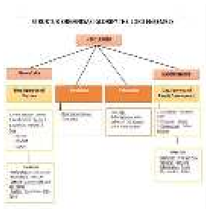
Figure 4. Organisational Structure of Glorify the Lord Ensemble.