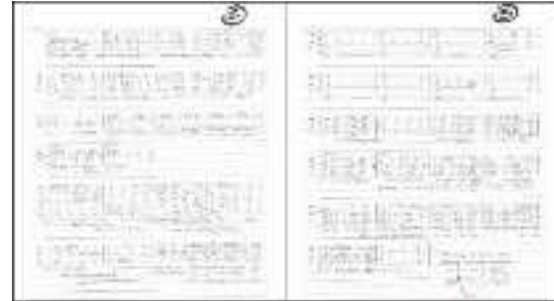
Figure 5. Sheet music for Glorify the Lord Ensemble Choir Practice.

rapport, understanding the emotion of the song and performing convincing choreography. All of these elements come together at every rehearsal, creating a beautiful harmony in every Glorify the Lord Ensemble performance.