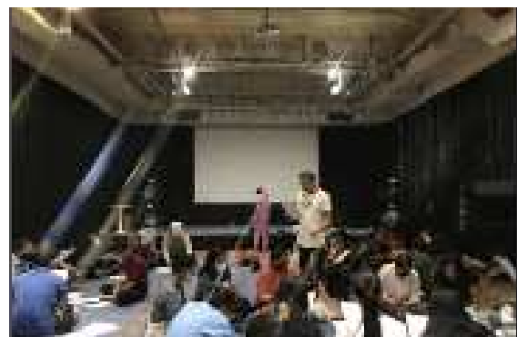
Figure 7. Glorify the Lord Ensemble Choir Choreography Rehearsal Process.