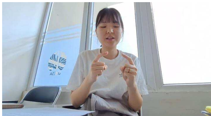
Figure 2. Students Answering Spoken Final Test

and assessments designed to measure learners' progress in enabling them to learn about Indonesian culture. These tests include oral tests, which are conducted at UAS by Unesa students through question-and-answer activities, written tests, which involve working on questions, field studies, when BIPA students participate in Indonesian Department Week activities organized by the Department's Student Association, and project-based tests, when BIPA students create PowerPoint presentations. The BIPA program emphasizes the importance of having qualified and experienced teachers to teach Indonesian to foreigners. Trained and experienced teachers can provide a more effective learning experience. Some of these assessments are illustrated in Figures 2 and 3.