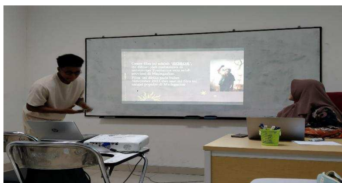
Figure 3. Students Presenting PowerPoint

The successful application of cultural transfer to BIPA students can be measured through several indicators that reflect their integration into Indonesian culture. One form of this is when they can communicate fluently and appropriately using Indonesian in everyday contexts. BIPA students who can understand and apply vocabulary and expressions in cultural contexts demonstrate success in transferring cultural knowledge into their language skills. Additionally, the active participation of BIPA students in local community activities can also be considered an indicator of successful cultural transfer. Students who are actively involved in such activities show a deep interest in Indonesian culture. This success not only enriches the students' experience but also strengthens the cultural ties between them and Indonesia. Thus, the success of cultural transfer in BIPA education extends beyond language skills to include participation and appreciation of culture in daily life.