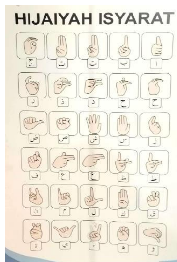
Figure 1. Hijaiyyah Letter Gestures

The finger movements used in this method engage motor memory reinforcement, helping learners associate each verse with specific physical patterns that make it easier to recall over the long term. At the same time, the use of these cues strengthens visual processing by converting the Qur'anic symbols—which are inherently abstract—into more concrete forms that are easily recognized by deaf children. Just like the sign language of the alphabet, each hijaiyyah letter in this method also has a special finger movement as a form of visual representation.