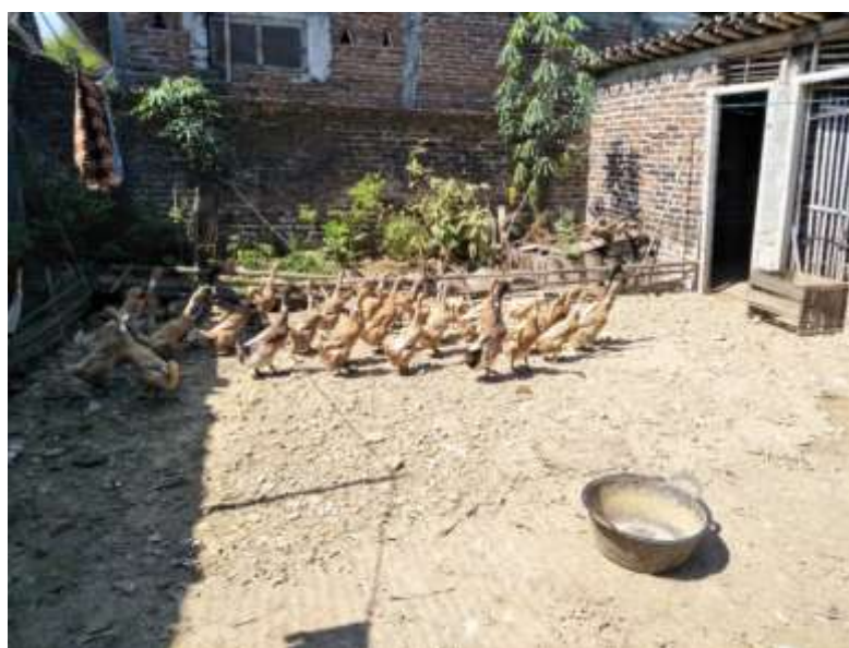
Figure 1. Magelang duck farm in Magelang district

drinking containers, sanitation tools, and other supporting facilities that play an important role in optimizing duck farming. A moderate score in this aspect indicates that most farmers already have the basic facilities needed, but the quality and quantity are not yet fully adequate. This condition can be attributed to several factors: (1) Limited business capital to improve existing facilities. The majority of Magelang duck farmers are small-scale farmers with limited capital. According to interviews, although farmers already have permanent or semi-permanent housing, the size remains