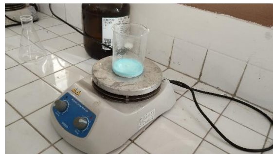
Figure 2. Process for Making Sol-Gel Solution

The next stage is to make a sol-gel solution by dissolving all the ingredients in ethanol (C 2 H 5 OH). Making the solution begins by mixing cobalt with HCl, which is added with a stirrer so that the ingredients are mixed and heated using an MSH-300 magnetic stirrer for 20 minutes. The heated solution was added to ethanol and titanium for 30 minutes to obtain a homogeneous solution. The aim of stirring the solution in a glass using a magnetic stirrer is so that all the ingredients mixed can become a homogeneous mixture and do not settle (Tebriani, Syukri, & Dahyunir., 2013). The following is a picture of pure titanium with added cobalt doping resulting from the solution-making process.