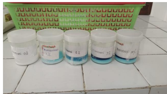
Figure 3. TiO 2 Solution with Concentrations of (0, 3, 6, 9, 12)%

From this image, it can be seen that there is a color difference between the solution with cobalt doping and the solution without doping. The pure TiO 2 solution without cobalt doping has a white color, while the solution added with cobalt doping has a darker color. It was found that the higher the amount of doping used, the clearer the resulting solution, and conversely, the lower the doping used, the darker the resulting color. Cobalt is a hard but brittle metal, bluish white in color, not very reactive, and dissolves in dilute mineral acids very slowly (Considine, 1981).