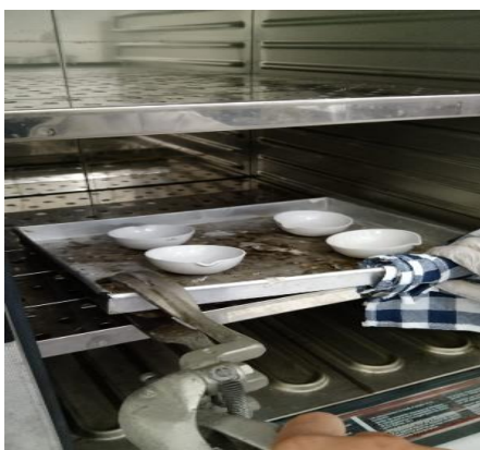
Figure 5. Heating the Glass Substrate

The next stage is the process of heating the sample using an oven at a temperature of 80° for \pm 30 minutes. The aim of the sample heating process is so that the liquid in the solvent after deposition on the glass substrate can evaporate and only leave a layer with relatively the same thickness, as well as maximizing the formation of crystals on the substrate used (Maddu et al., 2018). The following is a picture of the glass substrate oven process to obtain a thin layer sample.