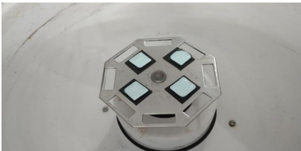
Figure 4. TiO 2 Thin Layer Deposition Process

After obtaining the sol-gel solution, deposition will be carried out on the glass substrate using a modified centrifuge. This process uses double-sided tape as a glass adhesive, and the glass is rotated based on the same concentration so that the solution on the glass surface does not mix. The glass that has been attached to the modified centrifuge will be dripped with \pm 10 drops of sol-gel solution until it covers the entire surface of the glass, then rotated at a rotational speed of 100 rpm for 1.5–2.0 minutes. The use of a modified centrifuge tool ensures that the sol-gel solution is evenly distributed on the surface of the glass substrate (Chandramohan et al., 2017). The following is a picture of the deposition process using a modified centrifuge.