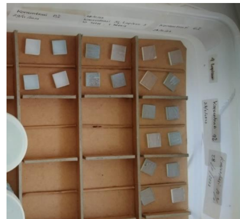
Figure 6. Thin Layer Samples with Concentrations of (0, 3, 6, 9, 12)%.

After the oven process, let the glass sit for \pm 1 minute before removing it from the porcelain cup. The glass substrate has different colors before and after the deposition and heating process. The appearance of the sample obtained from the heating process is that when using a pure TiO 2 solution, the color of the glass becomes dark white and thicker than when using a solution with cobalt doping added. The following displays a sample obtained from the heating process.