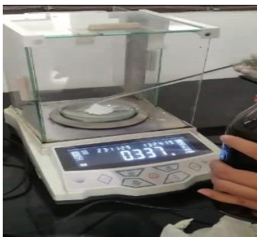
Figure 1. Process of Weighing Titanium and Cobalt

The following is a picture of the preparation process for the materials used to make the sol-gel solution.