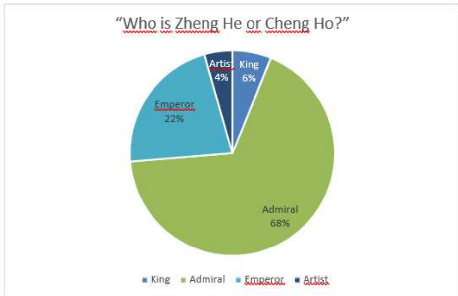
Figure 2. "Who is Zheng He or Cheng Ho?"

There are still many wrong perceptions of Zheng He's figure (as many as 32%) supporting the statement that Zheng He is still not popular compared to other explorer figures such as Ibn Batutta and Christopher Columbus. Of those same data showed that many who do not know the contributions of Zheng He or Cheng Ho in spreading Islam in Indonesia, only 46% of respondents who know about it. Many respondents showed surprise when they learned this fact. On the contrary, most of the respondents considered that after his arrival in Indonesia it was Zheng He who converted to Islam. There were even some respondents who answered that Zheng He's contribution was expel the Dutch from Indonesia. The high misperception about who Zheng He is and his contribution in Indonesia shows that there is still a stereotype that there is no common thread between China and Islam. As constructed in society: China is non-Muslim, even though the existence of Zheng He with his legacy managed to break this proposition.