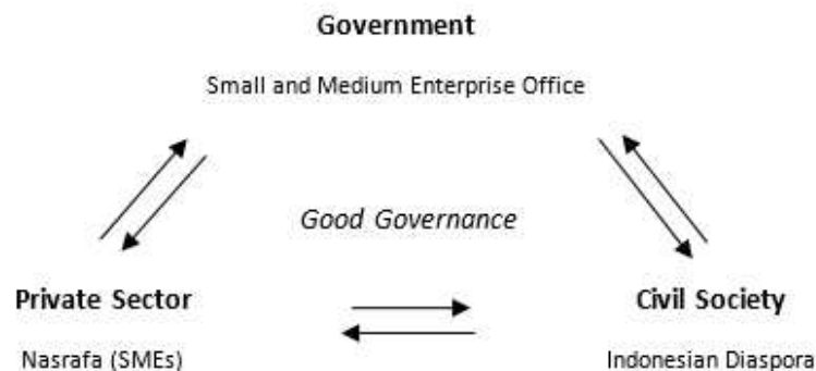
Figure 1. Good Governance in Internationalization of Nasrafa

According to UNDP (2014), good governance is a good governance relationship between the government and society through policymaking that is related to economic and socio-political activities, and the use of natural and human resources. The government is essentially one of the actors in the governance conception, but not necessarily the dominant actor. The role of the government as the providers of services and infrastructure in development has shifted to be the driving force in creating an environment that can facilitate all parties in the community, such as the private sector and the public sector. Good governance is an implementation of solid and responsible development management that is in line with the principles of democracy and an efficient market. According to Sedarmayanti (2012), good governance encourages openness of active participation that involves the government, the private sector, and civil society. In this regard, the government runs the state activities, while the private sectors are engaged in business interactions and market activities that include manufacturing, trade, banking, cooperatives, and informal sectors. Civil Society is a community group between the government and individuals and other community groups that interact socially, politically, and economically.