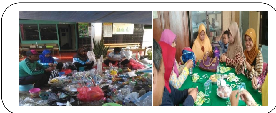
Source: Department of Environmental Sanitary and Landscaping of Kediri City 2018