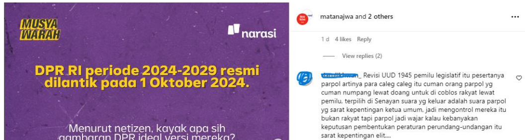
Figure 2. Example of Criticism