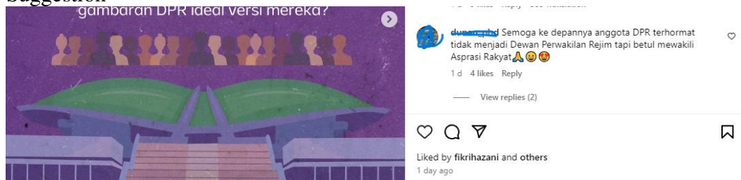
Figure 3. Example of Suggestion