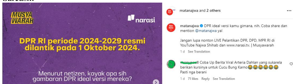
Figure 1. Example of Sarcasm