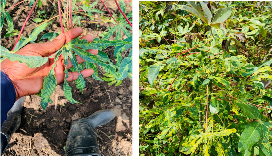
Figure 1. Symptoms of observed viral diseases