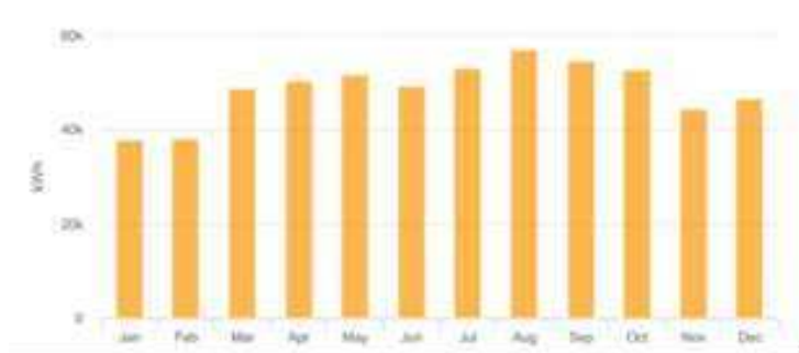
Figure 4. Energy Acquisition Using Software