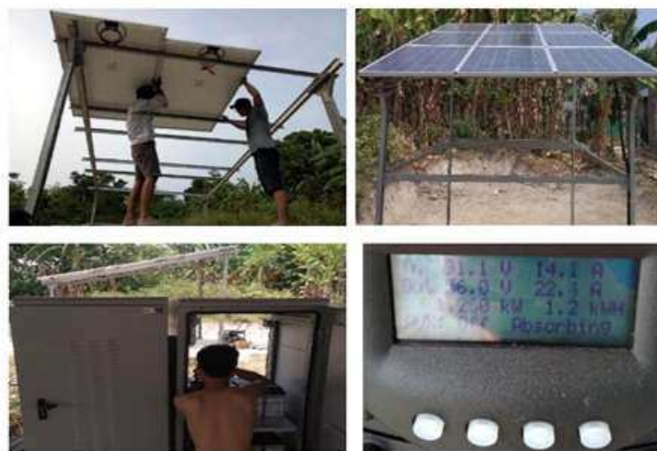
Figure 2. Installation of solar modules

Charging a 200 Ah battery using a 466.6 kWp solar panel as the source. Based on the available roof area data, a rooftop solar power system was selected consisting of 466.6 kWp solar modules and a 440 kW grid inverter. The design of the solar module installation with the solar panel's photovoltaic process requires approximately 2 hours with a stable voltage condition to charge the battery to its maximum level, given the existing solar panel specifications.