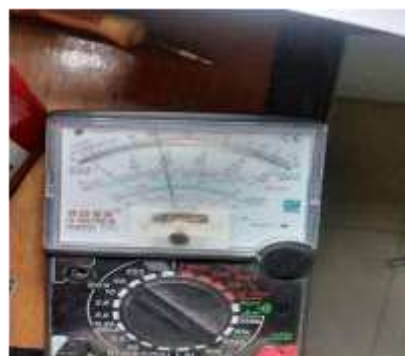
Figure 3. Solar Panel Output Voltage Measurement