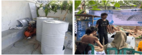
Figure 17. (Proker Installation & Extension)