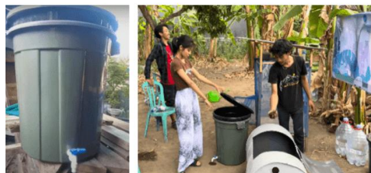
Figure 19. (Socialization of Composter Barrels)

Composting barrels are tools or containers used to process organic waste into compost naturally with the main purpose of composting vats is to decompose organic matter, such as food scraps, dry leaves, grass, and other organic waste into nutrient-rich compost (Purnomo, 2021).