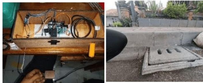
Figure 7. (Drainage Cleaning Machine Installation)