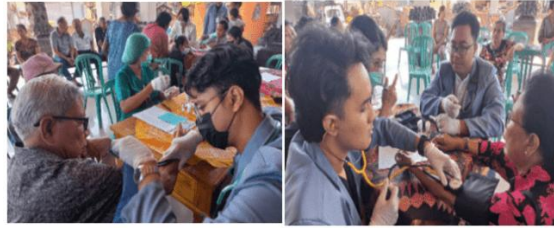
Figure 3. (Free Medical Checkup)