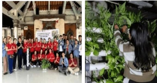
Figure 12. (Socialization of Hydroponics and Vegetable Harvesting)

Hidroponik Score = Point Pro-P Desak 25 miss= 0 2 & 3 Saraswati Dharma Saputra