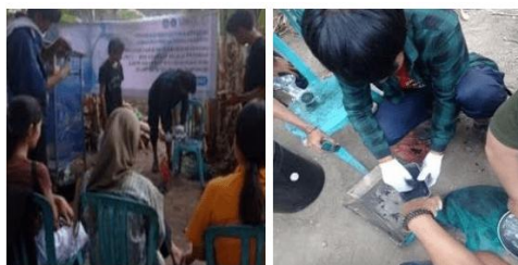
Figure 15. (Hands-on Installation)

In terms of price, briquettes are generally sold more expensive than charcoal. 1 kg charcoal briquettes in the market are sold for around Rp 25,000.00, while ordinary wood charcoal costs only Rp 7,000.00. The composition of glue is measured 3 tablespoons of starch with 400 ml of water mixed with charcoal powder that has been ground. Stir over low heat until the flour is mixed to form a glue dough. After that, it is formed according to the mold and dried in the sun for 2 days. It is hoped that this innovation can provide income to the community.