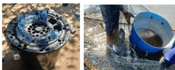
Figure 9. (Fish Seed and Bucket Aquaculture Installation)

The availability of fish in the sea will be depleted ( decrease ) if mass capturing fishing efforts continue ( increase ) there needs to be restocking efforts or transfer fish consumption to fresh commodities so that fish stocks in high waters remain sustainable (Supriyati, 2021) (Susilawati & Si, 2019). Cultivation using buckets is chosen because it can double harvesting . This activity invited resource person Muhammad Hendrajaya S.Pi. and was supported by BBI (Ringdikit Fish Seed Center).