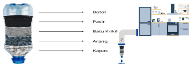
Gambar 8. (Model IPALS)

A simple, effective and affordable solution in sewage filtration. By using a large drinking bottle with a capacity of 1.5L with several filter media.