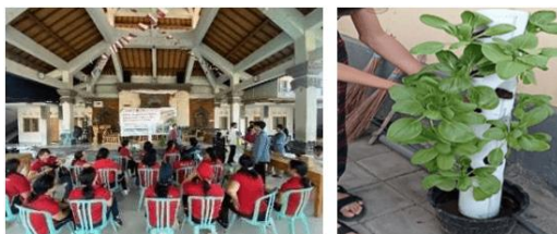
Figure 14. (Verticulture and Vegetable Harvesting Socialization)