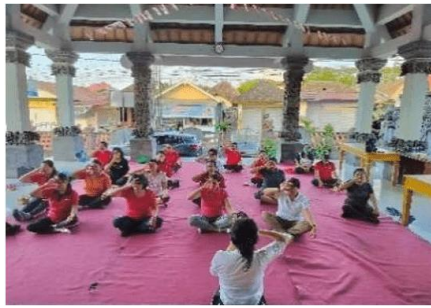
Figure 4. (Yoga and Meditation)