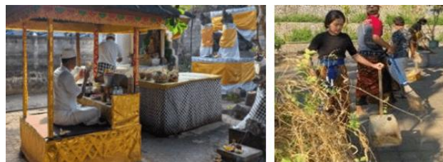
Figure 21. (Gotong Royong at Tirta Sudhamala Temple & Taman Alit Temple)

Gotong royong as one of the main activities in this program not only provides physical hygiene but also provides long-term benefits. (Widayati, S. (2020). In this activity we have held gotong-royong activities at several sacred arel points in traditional activities.