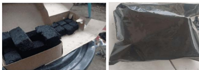
Figure 16. (Product ready for market)