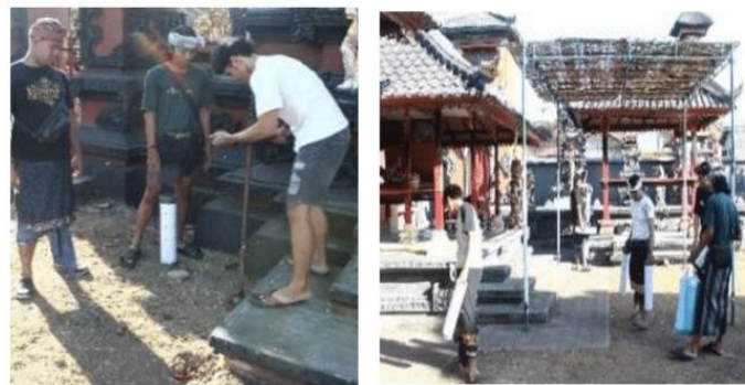
Figure 2. (Joint installation of STT Kel. Banyuasri)