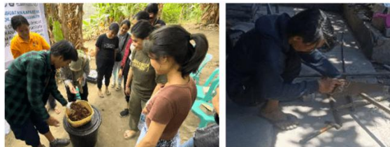
Figure 18. (Worm Tong Installation and Proker Counseling)

Composting Organic food waste using Eisenia Fetida worm as a composter, the disgetive residue of the metabolic activity of the worm produces vermicompost which is good for soil structure recovery. The worms are placed in a damp barrel and darkly covered. If the number of barrel worms continues to increase in one barrel, it can be used as ungags feed or protein-rich ornamental fish feed.