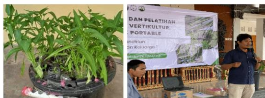
Gambar 10. (Setelah Siap Panen dan di Representasikan)