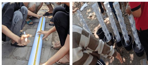
Figure 13. (Creation of Verticulture Installation)

Verticulture allows for a more efficient spatial layout. Increase crop productivity. By providing better access to sunlight, nutrients, and water (Wahyudi, 2020). The size of Ventri is a 4-inch pipe and uses a pot as a support.