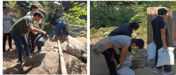
Figure 20. (Soil nutrient enhancement activities)

The implementation of an integrated agricultural system in yards / dry land is expected to improve food security. This program accommodates 3 joint programs as the central area of waste recycling management and ventricultre agriculture, all socialization activities of 3 combined waste management programs are held on rehabilitation/vacant land.