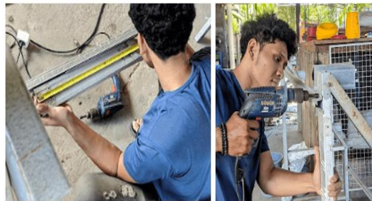
Figure 11. (Hydroponic Installation Assembly)