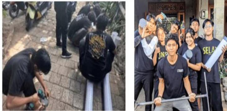
Figure 1. (Pipe Punching and Cutting)