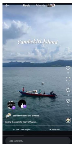
Figure 6. @patriotwondama's Instagram Reels