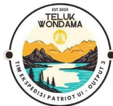
Figure 2. "Patriot Wondama" Logo

In terms of color composition, the blue of the sea symbolizes clarity and the natural purity of the region's landscape. Meanwhile, the orange hue on the mountains signifies a gradient between the blue of Teluk Wondama and the yellow of the Makara UI, representing a synergy that aspires to bring growth and advancement to the region.