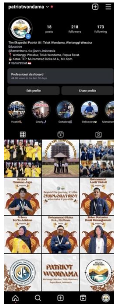
Figure 3. @patriotwondama's Instagram Profile

Subsequent uploads were related to the activities of the Ekspedisi Patriot Team, such as outreach sessions on the use and production of seedling containers ( koker ) made from banana leaves as an alternative to polybags, which can cause soil contamination (Sumarni & Isnantyo, 2017). This outreach activity was conducted for residents of Settlement Unit 2 (Satuan Pemukiman 2) and carried out by the five members of the Ekspedisi Patriot Team in Weriangi–Werabur, in collaboration with two agricultural extension officers from Penyuluh Pertanian dari Dinas Pertanian dan Pangan Teluk Wondama.