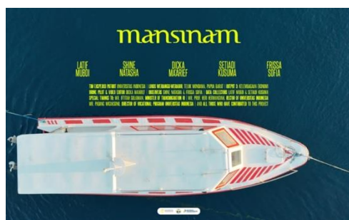
Figure 8. "Mansinam" Video Cover

One notable example can be seen in the cover design of the “Mansinam” upload, as shown in Figure 8, which visually integrates these motifs to symbolize both local identity and institutional affiliation.