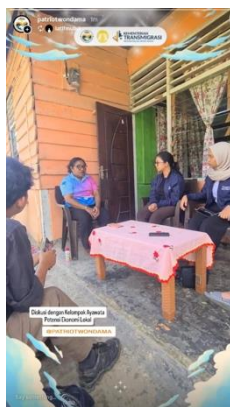
Figure 5. @patriotwondama's Instagram Stories

Instagram Stories are utilized to upload photos or videos of a temporary nature, as the content automatically disappears within 24 hours. Therefore, their use is primarily emphasized for sharing daily or time-sensitive content.