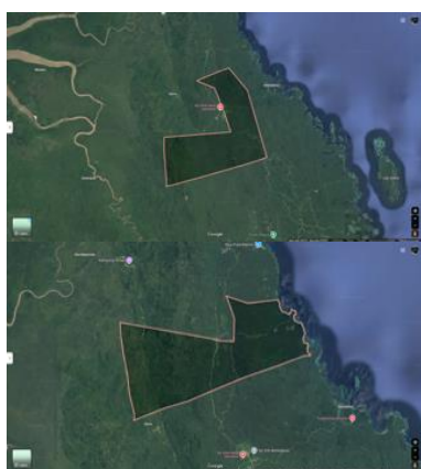
Figure 1. Werianggi-Werabur Maps

Recent studies conducted by the BRIDA (Weking, 2024) also highlight the importance of strengthening local economic institutions in the area, such as fisheries cooperatives, women's business groups, and the development of Badan Usaha Milik Desa (BUMDesa) as the backbone of the rural economy.