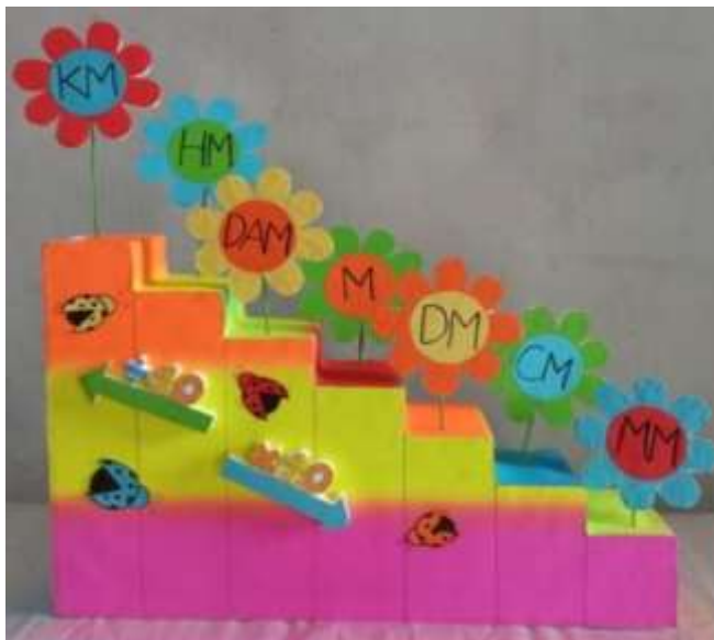
Figure 5. Length unit ladder (Lestari et al., 2023)

This learning media is a type of non-moving visual learning media in the form of teaching aids. The visual aids in this media show a ladder where each step has units of length arranged sequentially, namely kilometers, hectares, decameters, meters, decimeters, centimeters, and millimeters. The purpose of using this media is to help students convert length units correctly. This learning media is used in high classes, namely class 4 and class 5.