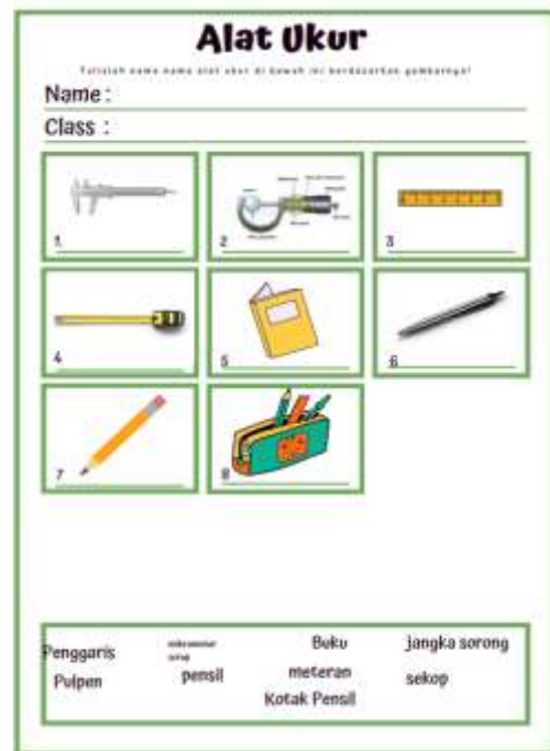
Figure 3. Measuring Instrument Introduction Board

The use of this learning media is quite simple. Teachers only need to prepare as many learning media as there are students and share them. Then the teacher guides and directs the students to match the names of the measuring instruments at the bottom of the board with the pictures on the learning media board. Even though there are no mathematical calculation operations in this media, an introduction to existing measuring tools is important so that students have initial knowledge before being able to collect data and