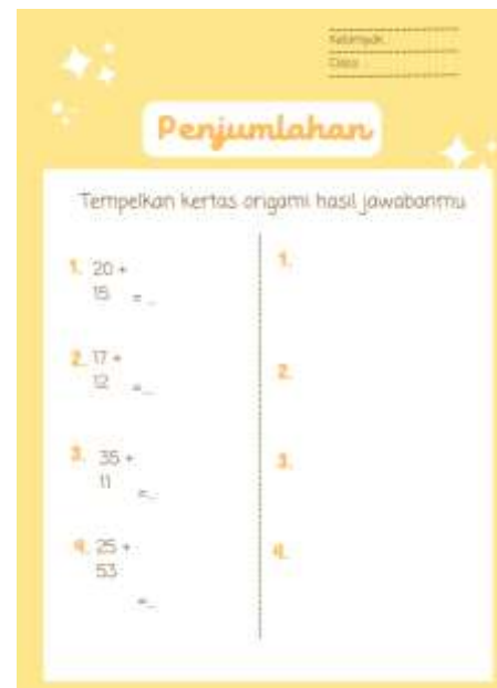
Figure 1. Type A Addition and Subtraction Board Media

This learning media is a type of non-moving visual learning media in the form of images. In this media, there are simple arithmetic operations in the form of addition and subtraction (Figure 1). The purpose of making this media is to introduce mathematical calculation operations and practice solving skills. To make this learning media is not difficult, the teacher only needs to make it in the Microsoft Word or Canva application and prepare origami paper, the teacher can also add illustrations of fruit, or other objects that are useful. it is easy to count the numbers on the addition and subtraction board (Figure 2).