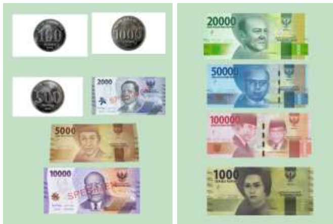
Figure 4. Specimen Rupiah currency

The use of this learning media is very fun and liked by students. This is because students also play roles when using this learning media. The use of this media can increase student engagement activities in the learning process (Narto & Mudjiarti, 2014; Nurmalia et al., 2022). Boring learning can be avoided by using this learning media so that meaningful learning can occur for students. Apart from that, this learning media can also increase student motivation (Lailiyah & Rahmawati, 2023) and student learning outcomes (Benu, 2021).