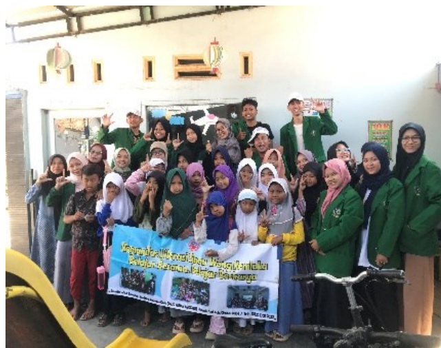
Figure 1. Socialization of Reading Park Activities

A reading park is a space that provides opportunities and facilities for the community or other group associations to read books. Reading parks are one of the efforts that can be made to increase literacy levels, especially reading literacy in a group of people. In this reading garden work program, people, especially children, can read any book that interests them. This is in line with what was said by the Directorate of Community Education, 2008, that "Reading Park is a place or space provided to store, maintain, use a collection of books, magazines, newspapers, and other multi-media materials to be read, studied, discussed and utilized. by the community individually, in groups or institutionally".