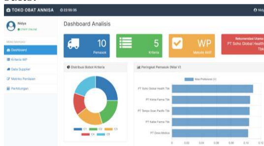
Image 3. Dashboard Analysis

To support the reported results, the following figures present the system information view of the developed web-based decision support system. The interface demonstrates how supplier assessment data are entered and how the WP method is executed to generate the ranking and recommendation. The dashboard view summarizes the number of suppliers and criteria and displays the final recommendation generated by the WP results.