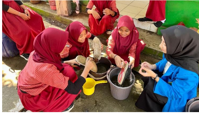
Figure 4. Cleaning Students' Shoe Soles Using a Used Mop Water