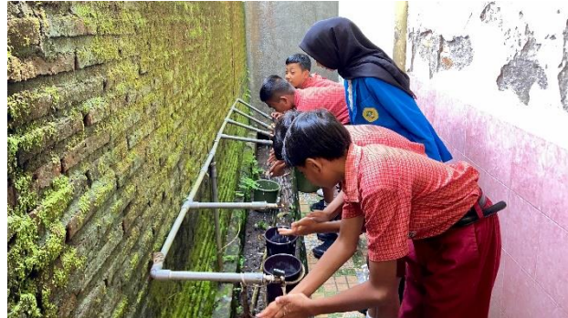
Figure 2. Wash Your Hands and Then Collect the Used Water in a Bucket

In the first stage, students engage in a handwashing activity together. At this stage, the used handwashing water is collected in a bucket because it is still relatively clean (not containing excess soap). This collection aims to ensure that the water, which is not yet too dirty, can still be reused for things that do not fully require clean water.