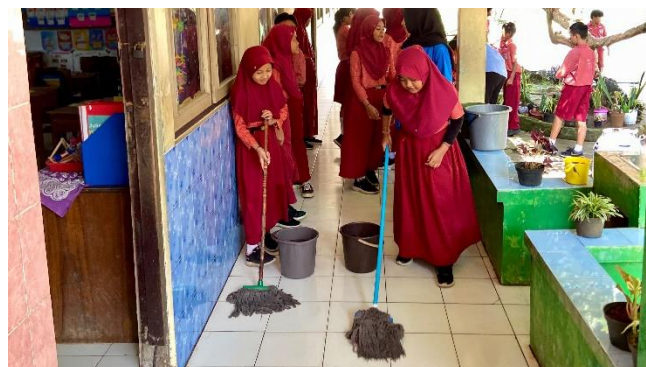
Figure 3. Use of Used Water for Mopping the Floor

After the used handwashing water is collected, it is reused to mop the floor. This is a simple water recycling practice, where the application of water quality and cleanliness standards is still taken into account. This aims to maintain the effectiveness of floor cleaning to avoid potential health risks.