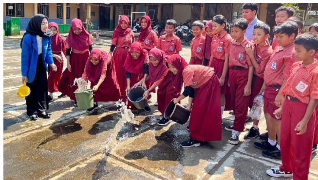
Figure 5. Watering the School Yard Using Water from Washing Shoe Soles

The final step is to use water that has already been heavily degraded to water the schoolyard, which has a surface made of paving or cement. This aims to reduce dust in the schoolyard. However, it is important to remember that the chemical content in soap can reduce soil fertility and disrupt soil microorganisms. Therefore, watering should not be done directly on the soil to avoid damaging the soil structure and to remain environmentally friendly.