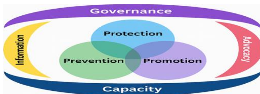
Figure 2: Key focus of the Global Charter for Public Health (Sources: World Federation of Public Health Associations (WFPHA) Global Charter for the Public's Health)

Another notable and relevant global law as it concerns the safety of public health is the Global Charter for Public Health, which is a collaborative initiative of the World Health Organisation and the World Federation of Public Health Association. The charter provides for the following main focuses, such as Governance, Protection, Prevention, Information and Advocacy, which a represented in a diagram below.