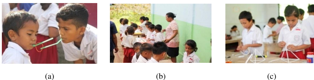
Figure 1. Peer tutoring with techniques of: (a) games, (b) project, (c) demonstration

Planning the second cycle is based on the results of the reflection of the first cycle. There has not been a significant change in the character of students taught using the peer-teaching method in inclusive classroom settings caused by the low ability of teachers to implement learning using the method. In this cycle, continuous assistance was given to the teacher in implementing the peer tutoring method. The second cycle of planning stages began with mentoring to teachers in implementing the peer tutoring method. The mentoring plan started by choosing the right learning techniques that the teacher could use to teach students character. Then, together with the teachers to develop learning using peer tutoring methods by including various learning techniques that could foster student character. Stages of action and observation were carried out to see the level of change in character in students. First is the stages of action; implementing learning using peer tutoring with various techniques. At the stage of the action, students were trained to have good characters. In teaching these characters, the teacher used a peer tutoring method that had been modified with various learning techniques. Peer tutoring with techniques of (a) games, (b) project, (c) demonstration, can be shown in Figure 1.