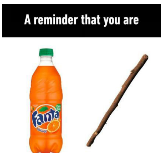
Figure 1. A Reminder

Regarding the verbal component, the signifier is located at the top of the meme and consists of the text “a reminder that you are.” This verbal signifier conveys a statement from the creator of the Internet meme to the audience, expressing a specific claim. However, the meaning behind this statement can only be fully comprehended by combining it with the visual signifier.