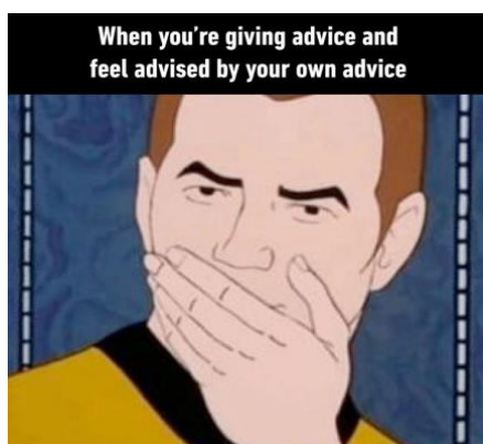
Figure 4. Realization