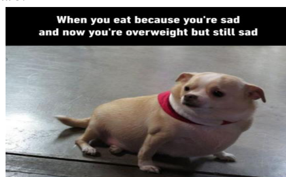
Figure 5. Sadness

Together, the verbal and visual signs in the sentences convey the idea that giving advice can sometimes result in surprising self-discovery, which reinforces the ideology of self-improvement through communication and socialization. This reinforces the myth that giving advice is a common and helpful way for people to interact with each other.