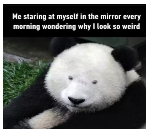
Figure 6. Weirdo