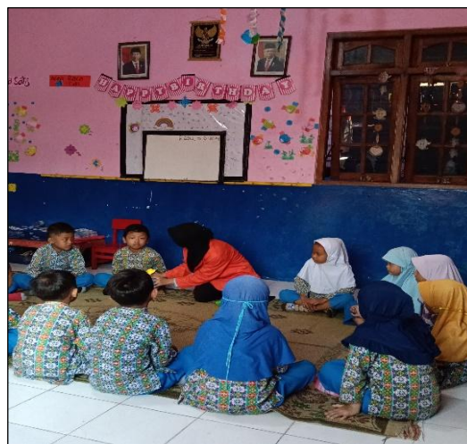
Figure 2. Aircraft Quiz

Aircraft Quiz is an interactive learning method specifically designed for preschool children. This method uses airplane-themed games to help children answer questions related to pre-tests and post-tests about violence against children. With a fun and visual approach.