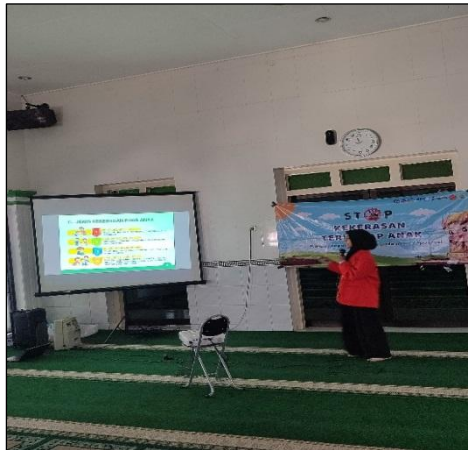
Figure 5. Parent Education

The Tree of Life method not only enhances understanding and awareness but also succeeds in strengthening the emotional bond between children and parents. In the educational process, students are given the opportunity to choose images of parenting experiences that they have encountered.