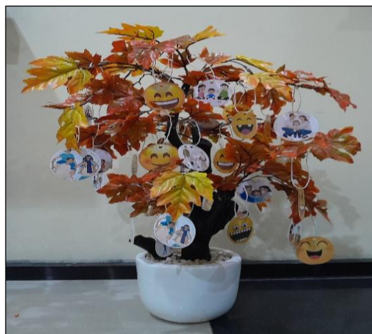
Figure 6. Good Treatment

The Tree of Life method not only enhances understanding and awareness but also succeeds in strengthening the emotional bond between children and parents. In the educational process, students are given the opportunity to choose images of parenting experiences that they have encountered.