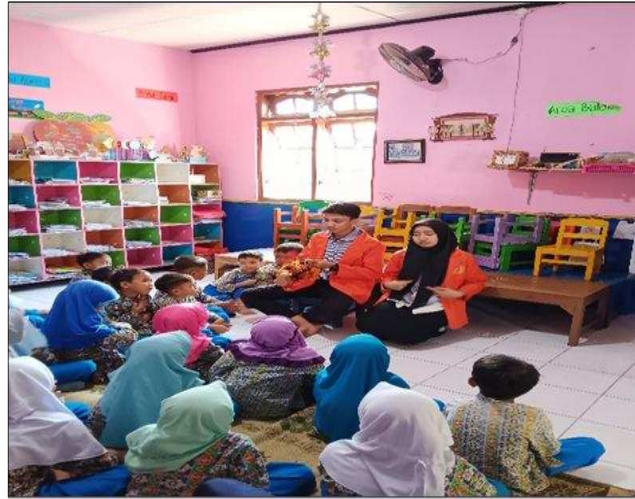
Figure 7. Student Education

This educational program was successfully implemented at the Islamic Kindergarten Bakti Sawahan, thanks to the active participation of students, parents, and teachers. After the program concluded, the school plans to continue using the Tree of Life method in daily learning activities and integrate it into the curriculum. To maintain the sustainability of the program, the school will conduct periodic evaluations to ensure that the material provided remains relevant and is understood well by both parents and children.