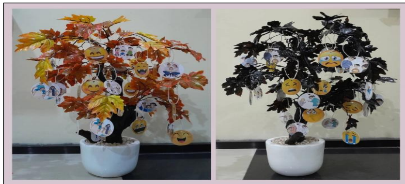
Figure 1. Tree of Life

Aircraft Quiz is an interactive learning method specifically designed for preschool children. This method uses airplane-themed games to help children answer questions related to pre-tests and post-tests about violence against children. With a fun and visual approach.