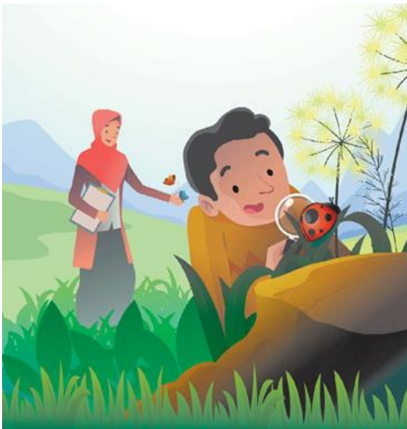
Fig. 2. Data 21/5/A

The stimulus image in Figure 2 has "Students are observing insects in the schoolyard." Captions are very important to support important reading stimuli. This way, students can understand the basic information needed to answer the questions critically.