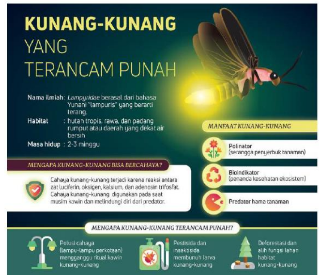
Fig. 3. Data 21/44/A

There are two types of questions in the Indonesian Language book for 10th grade in the 2013 curriculum. The format of the questions is a short answer test and an essay test. Below is a short answer question form.