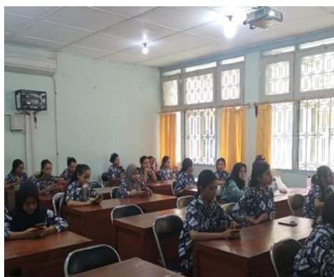
Students prepare answer

"Yes, I feel more confident. Sometimes I'm afraid of mispronouncing, but I just try to stay confident." (SZ)