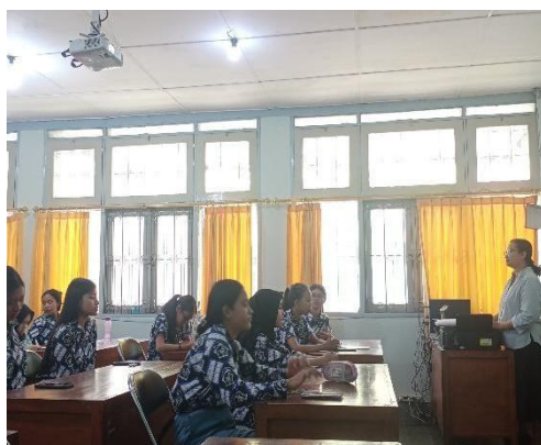
The teacher explains the question