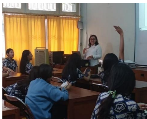
Student answer question