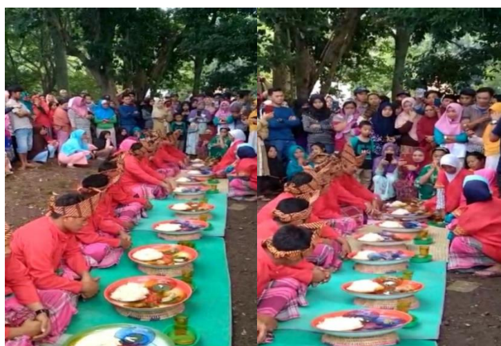
Figure 2. Pangadakkang

In addition to carrying out the traditions of Assongka Bala, traditionally the community protects themselves from the disgraceful actions regulated by adat in rituals. Pangadakkang (adat) applies when the community violates or commits a despicable act. This can cause diseases that cannot be detected by modern medical science. Society recognizes it as a special disease because of mistakes. It is said that the disease can be treated but cannot be cured and is very susceptible to an unnatural death. These diseases such as leprosy which are hereditary up to two times seven generations, the body is swollen and blackened, broken bones, accidents, and when he died his body suddenly decayed and blackened, Pangadakkang form as follows: