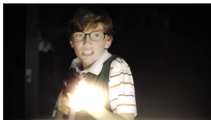
Figure 5. A child is furiously shooting at the band members