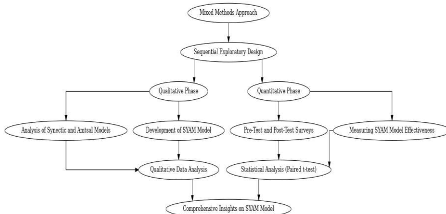
Diagram 1. Research Flow with Exploratory Sequential Design

The research began with a qualitative exploration phase, which involved analyzing the literature to design the SYAM model. This model was then implemented in PAI learning through treatment that included several synectic and Proverbs-based learning sessions. After the treatment , quantitative data were collected through pre-test and post-test questionnaires. The collected data were analyzed using descriptive analysis techniques for qualitative data and inferential statistical tests for quantitative data. The statistical analysis involved a paired sample t-test to compare pre-test and post-test scores, thus objectively measuring the effectiveness of the SYAM model. This combination of qualitative and quantitative analysis provides a holistic picture of the effectiveness of the learning model developed. The following chart shows the flow of the mixed methods research using an exploratory sequential design, including a qualitative phase to design the SYAM model and a quantitative phase to measure the results of implementing the model.