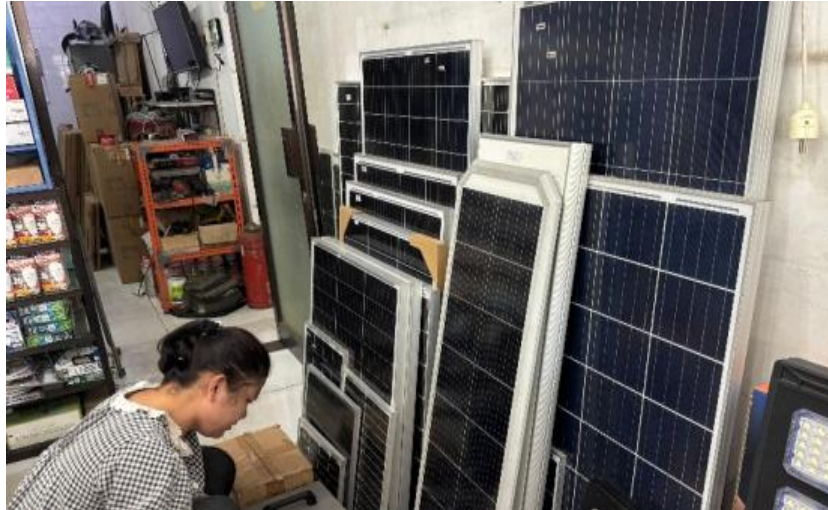
Figure 3. Procurement of material

online and makes logistical arrangements for the transportation and storage of tools and materials as well as distributing tools to the service locations. In addition to procuring tools, the team also formulated a training format for the development of organizational resources for members of the Ulugalung 1 farmer group in Salassae village.