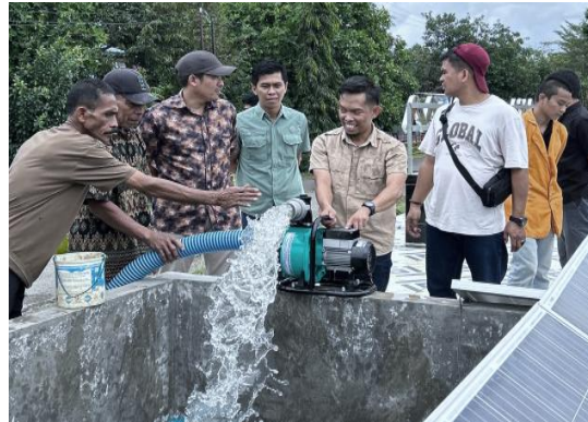
Figure 5. Implementation Techology