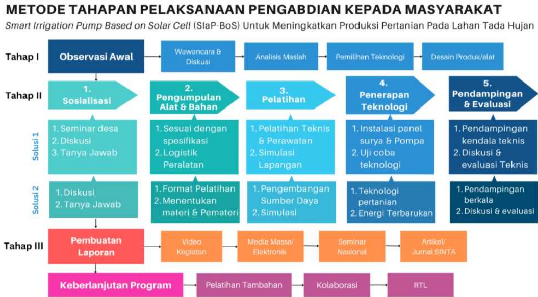
Figure 1. Implementation method