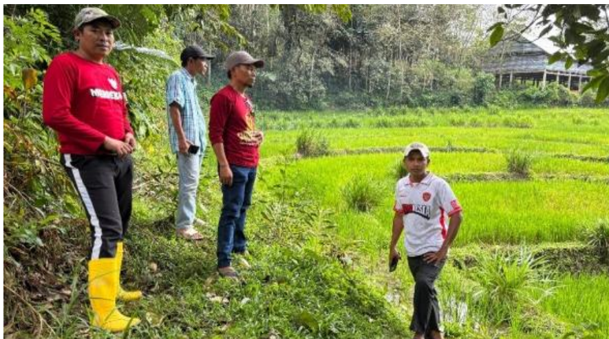
Figure 2. Socialization

Socialization is carried out to provide understanding to the community and farmers about Smart Irrigation Pump technology that uses solar energy. The stages are: Holding village meetings or discussions with farmer groups and village governments to explain the importance of using environmentally friendly energy-based irrigation technology, Explaining the benefits of solar cell-based Smart Irrigation Pump technology in optimizing water efficiency and reducing dependence on conventional irrigation methods. Providing insight into the development of solar cells and their application in areas with limited access to water and PLN electricity. Holding a question and answer session to explore obstacles in the field and gather input from farmers.