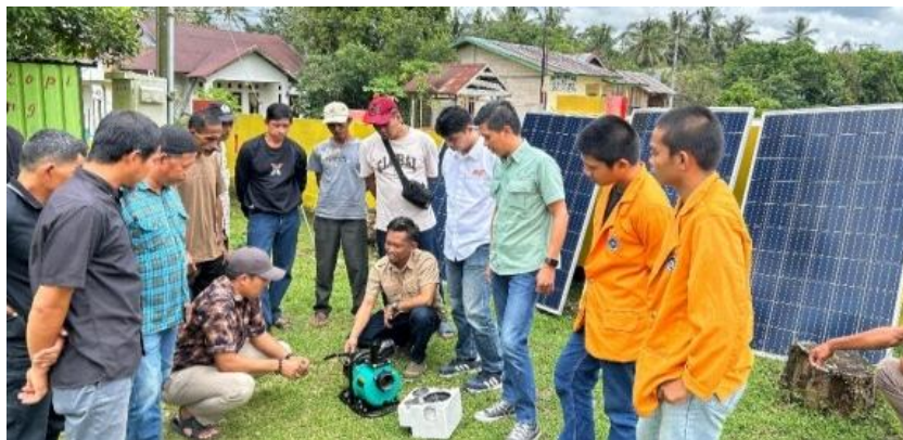
Figure 4. Training to using and maintenance

The service team conducted training to improve farmers' abilities in using and maintaining the Solar Cell-based Smart Irrigation Pump system. The stages include providing technical training on the installation and use of the Smart Irrigation Pump system, including the working principles of submersible pumps and solar cells, training farmers on how to maintain and maintain the system's performance to remain optimal, and conducting simulations directly in the field to involve farmers in the installation and testing of Solar Cell-based irrigation technology