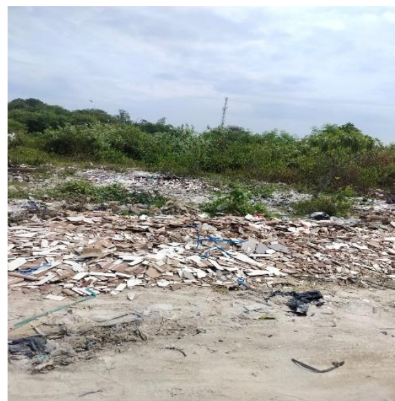
Figure 1. Ceramic Waste Pile in the Cikarang Pusat Area

The refractory cement utilized in this study was castable LR 68 , a commercial-grade product manufactured by PT Indoporlen, selected due to its high-temperature endurance and compatibility with various mineral additives. Kaolin, bentonite, and aluminate were purchased from commercial suppliers. The crushed ceramic powder used in the study were sourced from accumulated ceramic waste deposits located in the Cikarang Pusat area, where discarded tiles and sanitary ceramics from industrial production and household renovation waste are abundant, as shown in Figure 1.