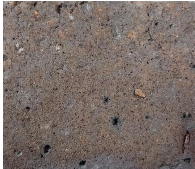
Figure 11. The visual appearance of the surface of sample variation S5.

From the visual observation, noticeable differences were identified in both the color and surface texture of the produced fire bricks across all variations. Before firing, the samples exhibited a gray coloration similar to that of ordinary cement. After undergoing the firing process, the samples experienced a distinct transformation in appearance, changing from gray to reddish-yellow hues. This color change indicates that mineral and chemical transformations occurred during the high-temperature sintering process. Furthermore, a gradual color gradation was observed among the variations, with darker tones appearing as the proportion of alternative materials increased. This phenomenon suggests that the inclusion of waste-derived components such as rubber ash, glass powder, and crushed ceramic powder influenced the surface oxidation and hardening process, thereby altering the overall visual characteristics of the fire bricks. From the test results, the average density, PCE test and compressive strength data were obtained, as shown in Table 3 .