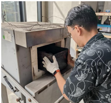
Figure 4. Firing Process of Samples