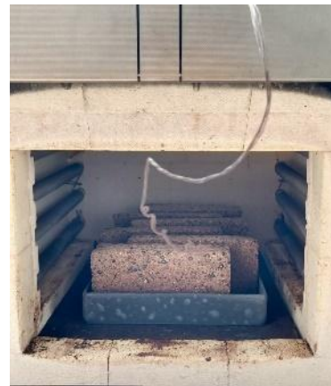
Figure 5. After Firing Process of Samples Using a Chamber Furnace

After firing process, fired brick samples, as shown in Figure 5 , were first allowed to cool naturally for a period of 24 hours to ensure that any residual thermal stresses induced during the firing process were relieved. This natural cooling process is critical for minimizing microcrack formation and structural damage, thereby maintaining the integrity of the fired bricks. After cooling, compressive strength tests were conducted on all specimens in accordance with ASTM C133. Prior to testing, the specimens were carefully cut into cubic shapes measuring 5 cm × 5 cm × 5 cm to ensure uniformity and comparability of the results. The tests were performed using a compression testing machine at a loading rate of 0.52 kN/s (or 31.2 kN/min) [17], and the maximum load