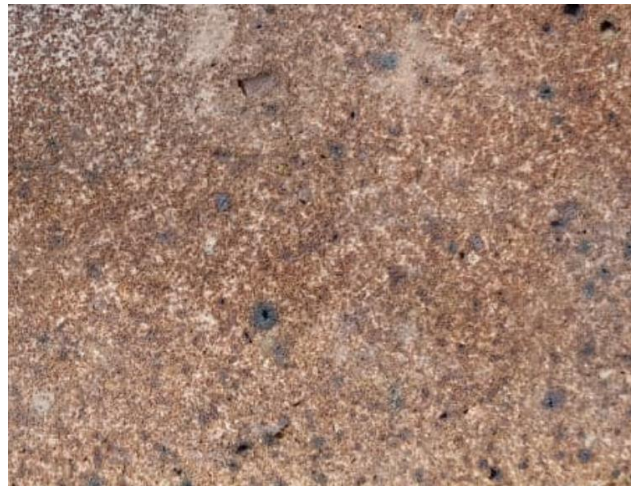
Figure 7. The visual appearance of the surface of sample variation S1.