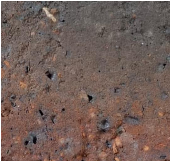
Figure 10. The visual appearance of the surface of sample variation S4.