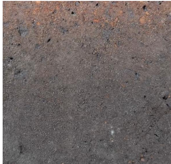
Figure 9. The visual appearance of the surface of sample variation S3.