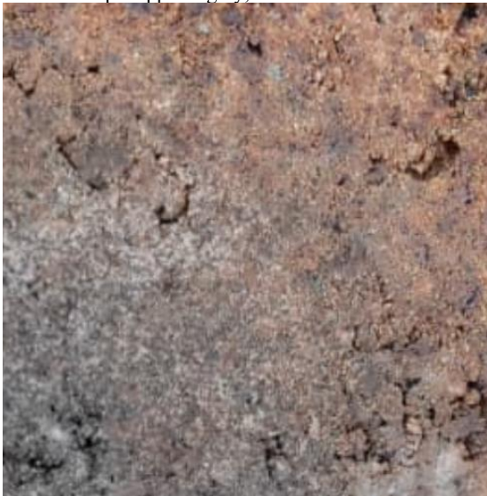
Figure 8. The visual appearance of the surface of sample variation S2.