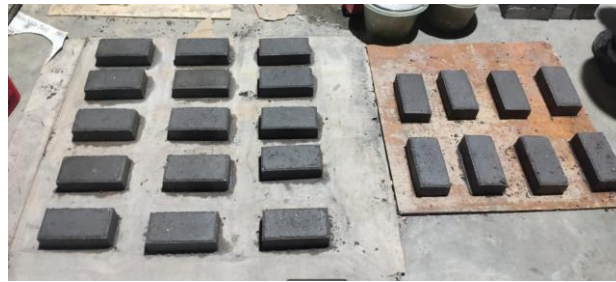
Figure 2. Production Process of Alternative Fire Brick Samples