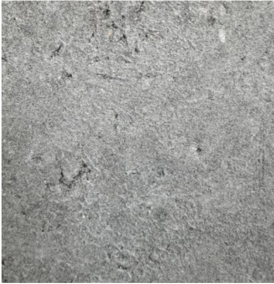
Figure 6. The visual appearance of the surface of the unburned sample appears gray, similar to the color of cement

From the production process, visual observations were obtained for each sample. Before the firing process, the surface of the samples appeared gray in color, similar to the color of cement, as shown in Figure 6. After the firing process, the samples exhibited a color change to yellowish tones, as illustrated in Figure 7 to Figure 11.