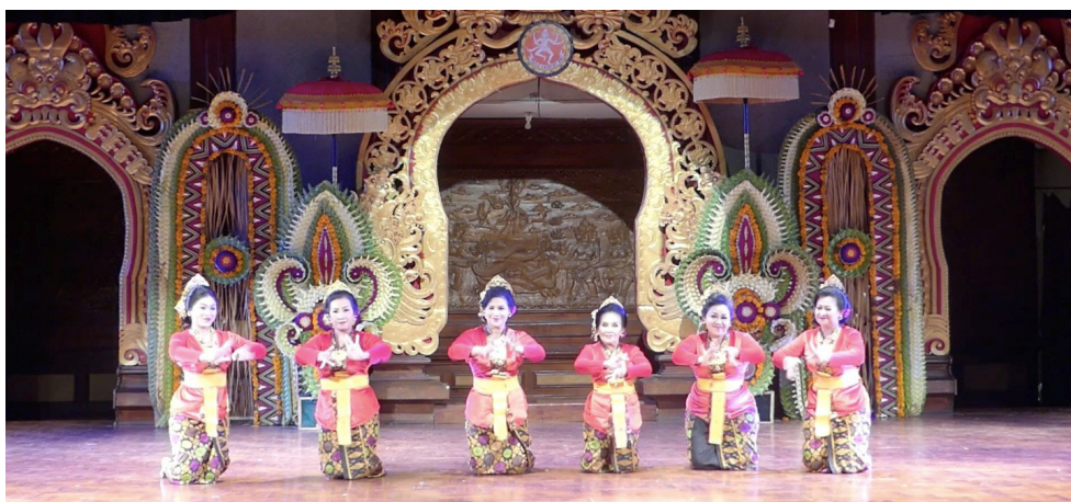
Picture 7. ISI Bali singer's performance during the Legendary Gong Kebyar Parade Bali Art Festival 2024 in performing The Composition Kebyar Dang "Citta Utsawa".

The analysis of I Wayan Beratha's work aligns with Ricoeur's perspective, which posits that performing arts, mainly traditional music, effectively disseminate ideological values within society. In this context, the composition Kebyar Dang "Citta Utsawa" represents a concrete manifestation of how ideological principles can be embedded within traditional artistic expressions.