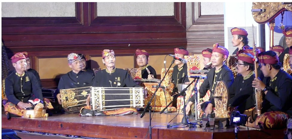
Picture 6. ISI Bali legendary musician, during the Legendary Gong Kebyar Parade, Bali Art Festival 2022.