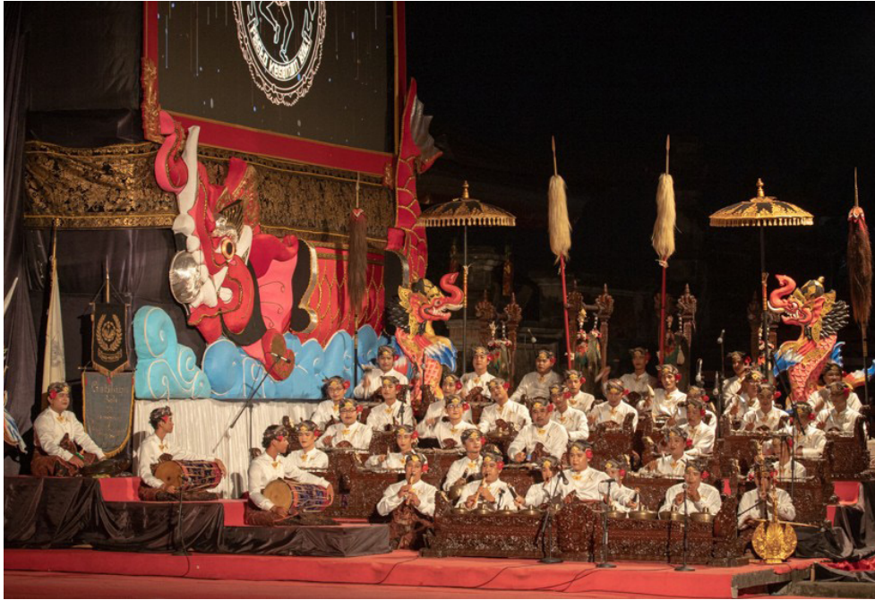
Picture 3. Gong Sadmerta Musician as the City of Denpasar ambassador for Gong Kebyar Legendaris Parade, Bali Art Festival 2023.