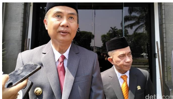
Figure 6. Main news image with title " Bey Sebut Jawa Barat Juara Umum PON XXI Aceh-Sumut "

News headline: Bey Sebut Jawa Barat Juara Umum PON XXI Aceh-Sumut (Bey mentions West Java as the overall champion of PON XXI Aceh-North Sumatra)