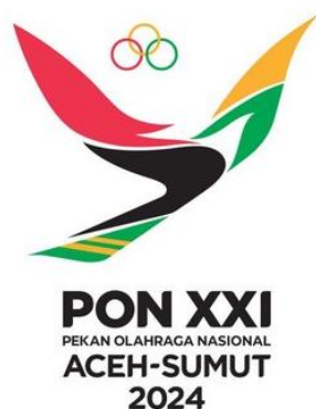
Figure 5. Main news image with title " KONI Jawa Barat Bersyukur Bisa 'Hatrick' Juara Umum PON 2024 "

News headline: KONI Jawa Barat Bersyukur Bisa 'Hatrick' Juara Umum PON 2024 (West Java's National Sports Committee of Indonesia Grateful for the Overall "Hatrick" Champion at PON 2024)