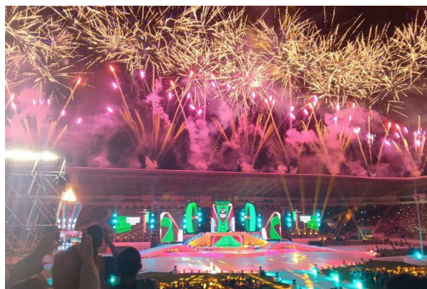
Figure 3. Main news image with title " Penutupan PON XXI, Jawa Barat Catat "Hatrick" Juara "

News headline: Penutupan PON XXI, Jawa Barat Catat "Hatrick" Juara (PON XXI Closing, West Java Records Champion "Hatrick")