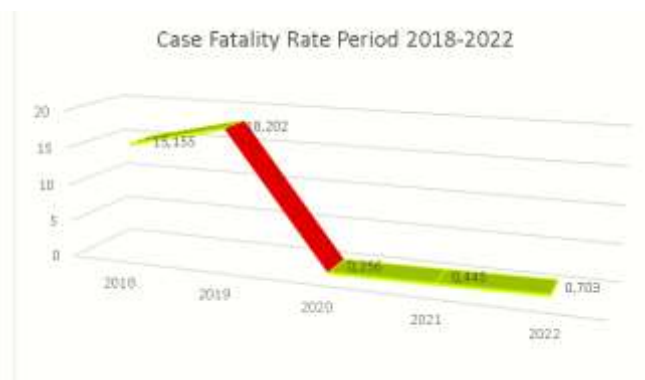
Figure 4. CFR Year 2018-2022

Source: North Sumatra Provincial Health Office, 2023