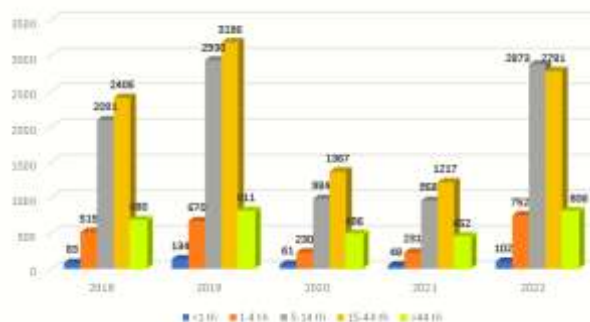
Figure 2. DHF Cases Based on Age in Period 2018-2022

Source: North Sumatra Provincial Health Office, 2023