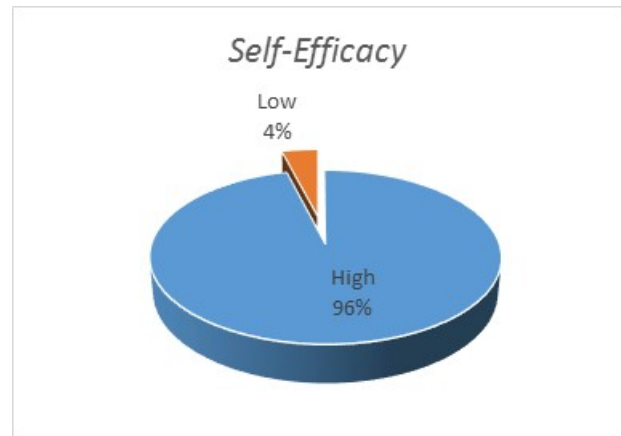
Figure 3 Self-efficacy of respondents

From the figure 2 & 3 above can be seen that from 76 respondents, 49 respondents (64.5%) had moderate knowledge and 73