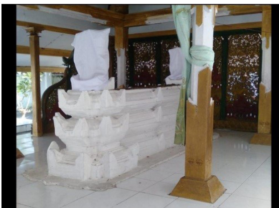
Figure 1. Prince's Tomb Ronggosukowati

The Pre-Colonial Era (16th Century) during the kingdom of Prince Ronggosukowati paid great attention to the needs of his people by reconstructing the city of Pamekasan so that it was in line with other cities. He left a legacy of Pamekasan city planning that still survives today. Among them are building Maseghit Ratoh at the current location of Asy Syuhada' Great Mosque, army dormitory at the current Kodim A dormitory area in the context of military reorganization, seppir (prison) at the current Kodim B dormitory area (moved to Jungcangcang in 1912), market at the current Pasar Sore area, and Se Jimat road at the current Arek Lancor Monument area. In his day, he was known as a leader who built basic infrastructure such as the government center and mosques that became cultural icons. Prince Ronggosukowati strengthened Pamekasan's position as the center of government by building the Jamik Mosque which became a symbol of Islamization in Madura (Manuscript, 1592).