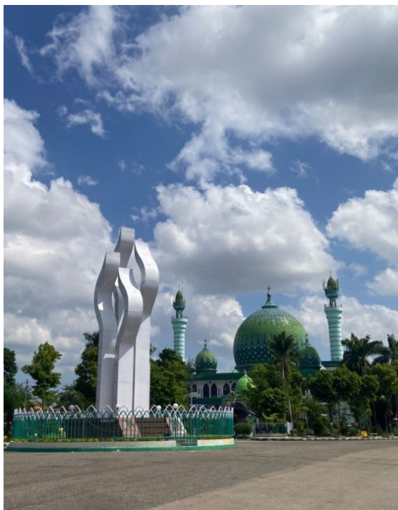
Figure 2. Pamekasan Grand Mosque

The existence of the mosque to mark movement the spread of Islam in Pamekasan. Actually This started since collapse kingdom Majapahit replaced by the kingdom Mataram. That was when the spread of Islam is increasing developing, including kingdoms under his power.