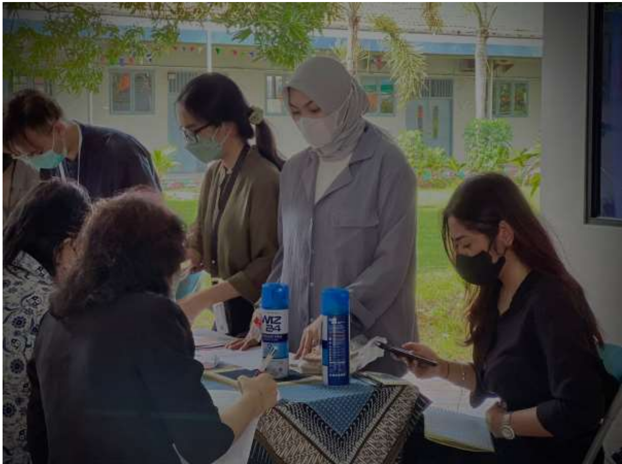
Figure 2. Questionnaire Filling Process in the Context of Disease Risk Factor Detection