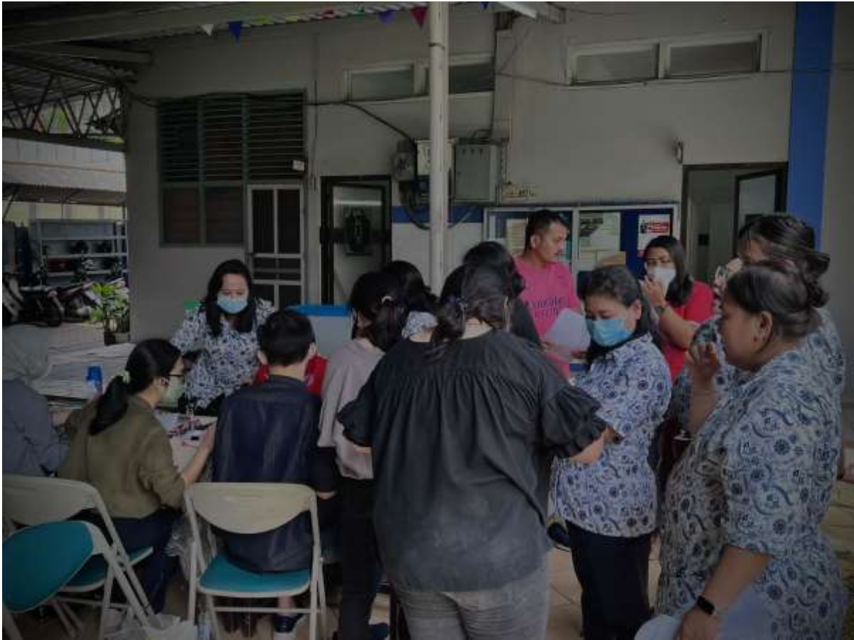
Figure 3. Activities in Checking Blood Pressure

High blood pressure, often known as hypertension, is a condition in which the blood pressure in the arteries remains consistently over normal. High blood pressure is mostly caused by hereditary factors, an unhealthy lifestyle, and environmental factors. A family history of high blood pressure, bad eating habits (heavy in salt and fat), obesity, lack of physical activity, smoking, excessive alcohol consumption, stress, and old age are all risk factors for developing hypertension.(Hoeper et al. 2013; Nerenberg et al. 2018)