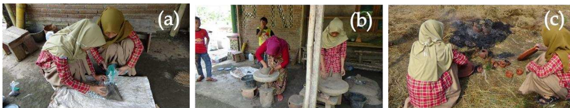
Figure 1. Making teapots with the addition of zeolite and activated charcoal (a) Ingredients formulation (b), Forming a clay pot, (c) Burning clay teapot

Making clay teapots is done by mixing zeolite powder and activated charcoal into clay (clay) with a certain composition according to the results of trial and error so that good quality teapots are obtained, namely according to standards set based on consumer desires and market demand (Hadiwijaya et al. , 2022).