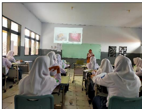
Figure 1. Student Activities at the Stimulation Stage

students' ability to answer questions related to the material had an average score of 3.73, most students were able to answer them well. At the stimulation stage, the 4C skills measured were creative thinking skills with creative thinking indicators (Sari et al., 2016), where students tended to explore something that had not been done. In this case, students had a desire to explore material that pupils had not learned, which are the reaction rate material. The student activities can be seen in Figure 1.