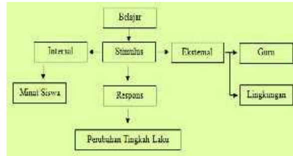
Figure 2: Schematic of the Learning and Learning Process According to John B. Watson.

The learning theory developed by Watson is Sarbon (stimulus and response bond theory). Sarbon is a theory that views learning as a process of reflex or conditional response through stimuli. According to Watson, humans are born with emotional reactions such as fear, love, anger. All these behaviors are formed by a relationship between stimuli and new responses through conditioning. The following is a picture of the learning and learning process according to John Broadus Watson: