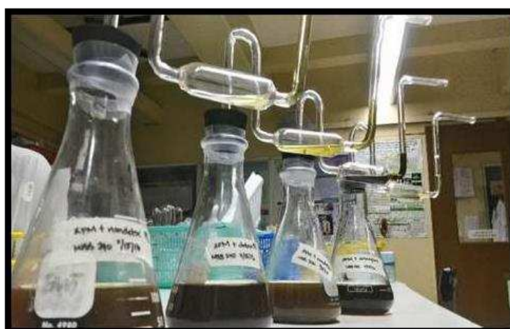
Figure 2. Flask fermentation Set-ups

For the bioreactor run, the setup contained 3.0 L of alcohol fermentation medium added with the supplements mentioned above. Inoculation rate was 300 mL of the yeast inoculum grown in YEPD broth. Fermentation was carried out in a 5-L bioreactor for 8 h at ambient condition and slow agitation (50 rpm) (Fig. 3). Ethanol was assayed after the run.