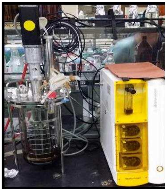
Figure 3. Upscale fermentation set-up using BioStat Bioreactor