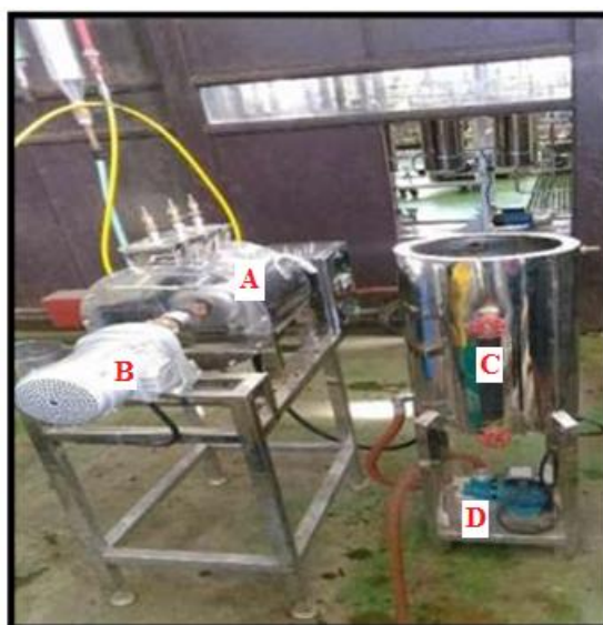
Figure 1. Saccharification Reactor used in the upscale enzymatic hydrolysis of pretreated banana pseudostem. The major components are reaction tank with rotating screw and jacket (A), motor (B), electrically-heated water drum for temperature control (C) and water pump (D).

The main substrate consisted of banana pseudostem hydrolysate supplemented with 1.4 \text{ gL}^{-1} (\text{NH}_4)_2\text{SO}_4 , 1.0 \text{ gL}^{-1} \text{KH}_2\text{PO}_4 and 0.05 \text{ gL}^{-1} \text{MgSO}_4 and pH adjusted to 5.0 prior to sterilization (NIBAM-UPLB Training Manual, 1987). Media were sterilized for 15 minutes (15 psi) at 121^\circ\text{C} . For this flask setup, changes in weight were monitored every 2 hours to account for \text{CO}_2 evolution.