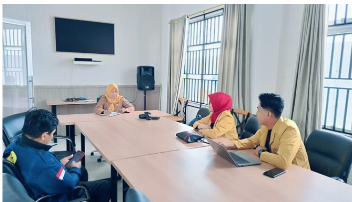
Figure 1. Survey and interview of the Head of UPTD PLUT-KUMKM Kendari City

The method used in this community service activity is an interactive discussion which includes the Preparation Phase and Implementation Phase. The steps in carrying out this service are by using an interactive discussion approach between participants and resource persons, accompanied by direct practice using a simple application, namely Excel. The location of this service is carried out at the PLUT office. The following are the steps taken in carrying out community service: