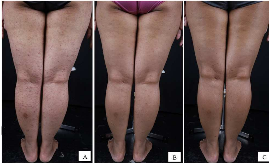
FIGURE 3. (A) Clinical presentation of the lower extremities before NB-UVB phototherapy, (B) after 18 sessions of NB-UVB phototherapy, and (C) after 37 sessions of NB-UVB phototherapy.