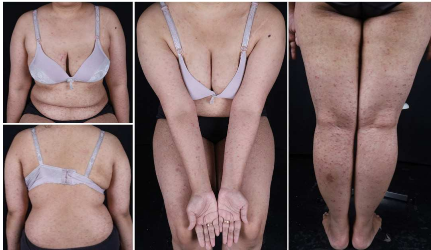
FIGURE 1. Clinical presentation of the patient at the first visit to the Dermatology and Venereology Outpatient Clinic, Dr. Sardjito General Hospital. Multiple erythematous papules, macules, patches, and plaques with scaling were observed on the trunk and extremities.