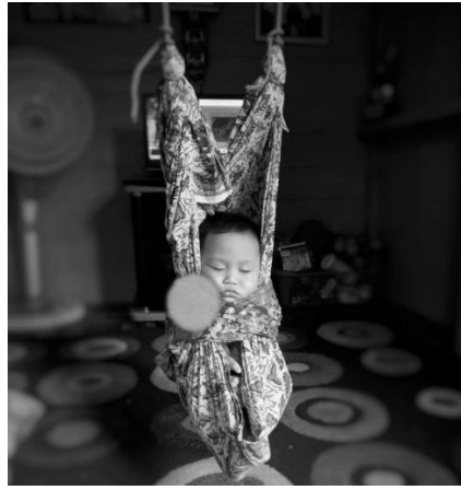
Figure 1. A child being gently cradled in a local wisdom Bapukung.

As vividly illustrated in Figure 1, where a child is securely cradled in a traditional bapukung swing, this practice exemplifies the Banjar people's ingenuity and commitment to maintaining familial bonds. The swing's design not only soothes the infant but also reinforces the importance of preserving cultural heritage while addressing contemporary parenting challenges. Martinez and Silva (2022) highlight that practices like bapukung serve as a bridge between cultural heritage and modern caregiving, strengthening familial bonds and supporting the psychological well-being of both infants and mothers. As a holistic parenting approach, bapukung enhances caregiving outcomes while preserving valuable cultural traditions.