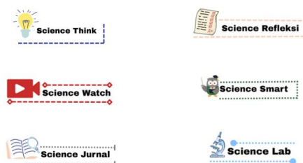
Figures 3. E-book features

In the developed phase, the e-book covers several topics related to ecosystems, including ecosystem components, interactions within ecosystems, energy flow, biogeochemical cycles, and ecosystem balance. The e-book consists of several main components: a cover page, a user manual, learning features, concept maps, learning outcomes, an introduction, main material, practice questions, and a glossary. Each component is designed to support the others: the concept map and learning outcomes help students understand the material's structure, while the introduction links the concept of ecosystems to the local context of Sendang Made as a real environment with biotic and abiotic components. The main material is presented in an integrated manner alongside local wisdom values, and it is equipped with interactive features to practice critical thinking skills, while practice questions and a glossary strengthen conceptual understanding. With this structure, the e-book not only serves as a medium for delivering material, but also as a contextual learning tool oriented towards developing students' critical thinking skills [16], [17].