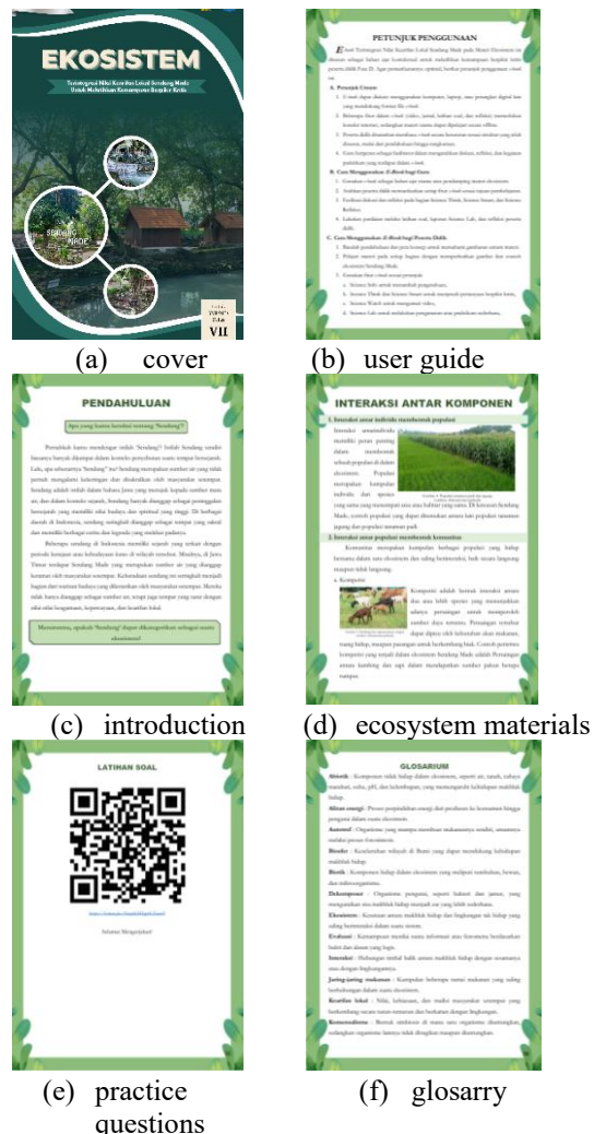
Figure 2. E-book design

The design phase involved systematically developing the e-book's content framework, encompassing material organization, visual design, and the determination of learning support features. This stage also involved aligning the e-book design with critical thinking indicators.