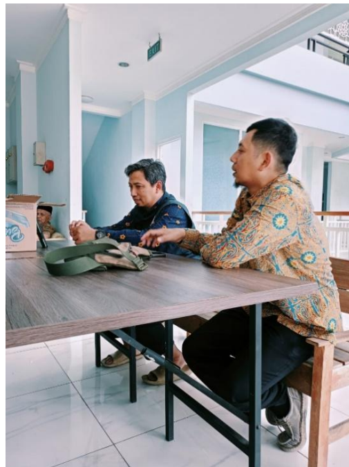
Figure 1 Interview Documents

While previous research examined cultural da'wah within the context of discourse on YouTube, this study will examine cultural da'wah directly as it is implemented in the Kasihan Yogyakarta PCM. To gain deeper insight into the implementation of cultural da'wah, interviews were conducted directly with the Tabligh Council of Muhammadiyah Central Board (PP Muhammadiyah), which also resides in the Kasihan District. The implementation of da'wah in Kasihan has actually long adopted the concept of cultural da'wah. The first interview was conducted with the Tabligh Council, as shown in the image below: