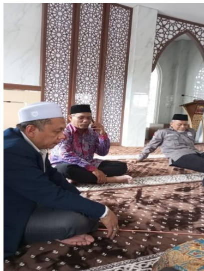
Figure 2 FGD with PCM Kasihan Yogyakarta

To deepen the implementation of cultural da'wah in the PCM Kasihan Bantul Yogyakarta, interviews were conducted with the PCM Kasihan Management as shown in the following picture: