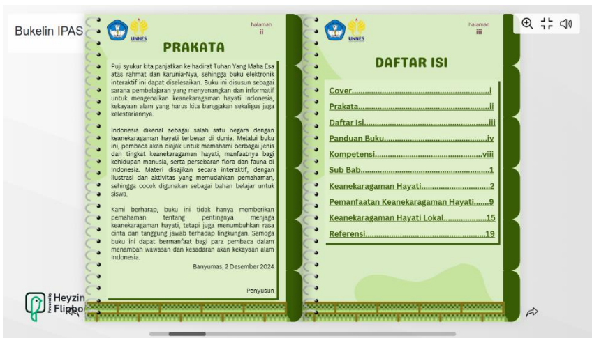
Figure 2. Preface and Table of Contents