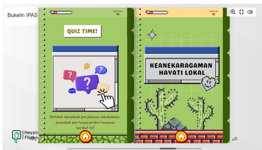
Figure 7. Interactive Quiz