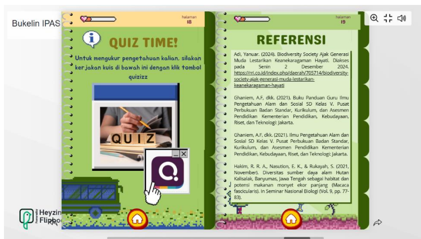
Figure 8. Evaluation and Reference