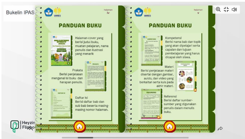
Figure 3. Book Guide