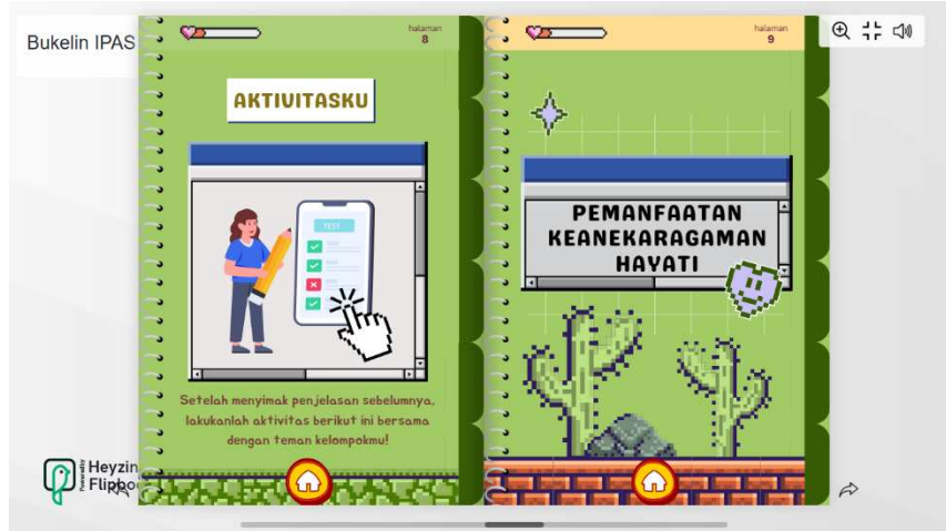
Figure 6. E-LKPD