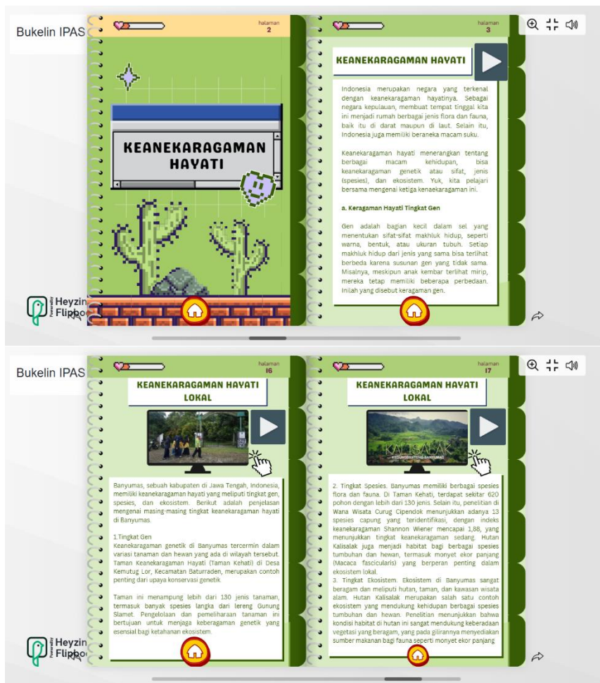
Figure 5. Subtopic Material and Content of Material