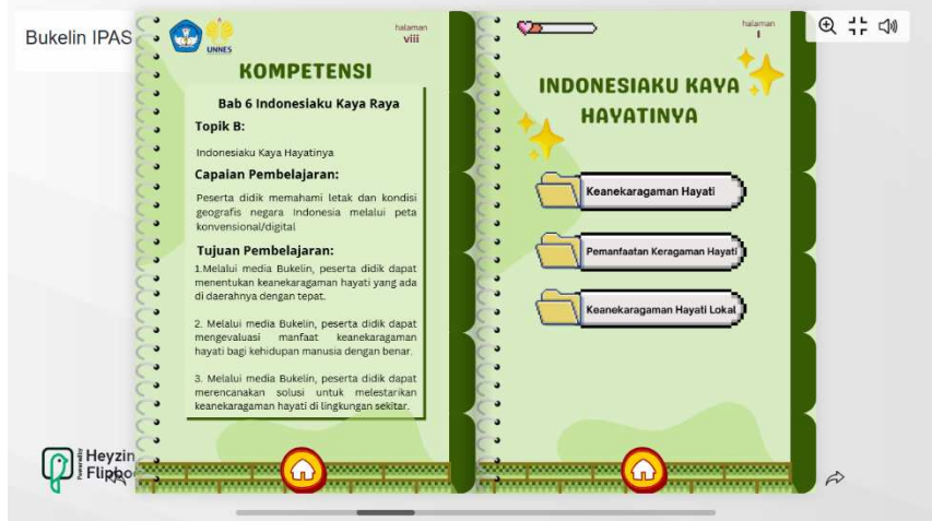
Figure 4. Competencies and Material Topics