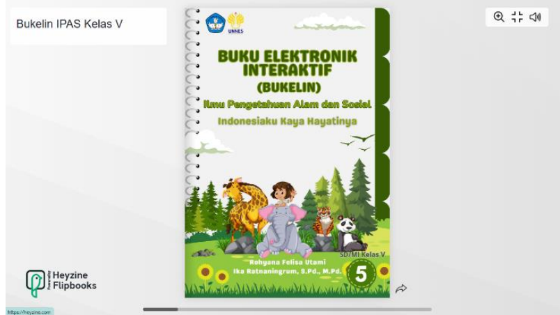
Figure 1. Cover Bukelin